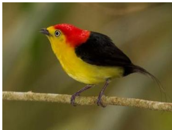
Wire-tailed Manakin

NIGHT: Ecolodge Juan Solito, Reserva Casanare, Colombian Llanos