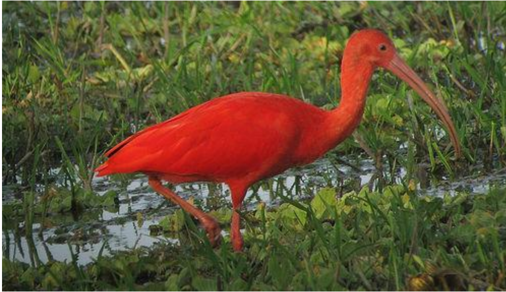
Scarlet Ibis © David Ascanio

Transfers to the airport will be provided for departures at any time today.