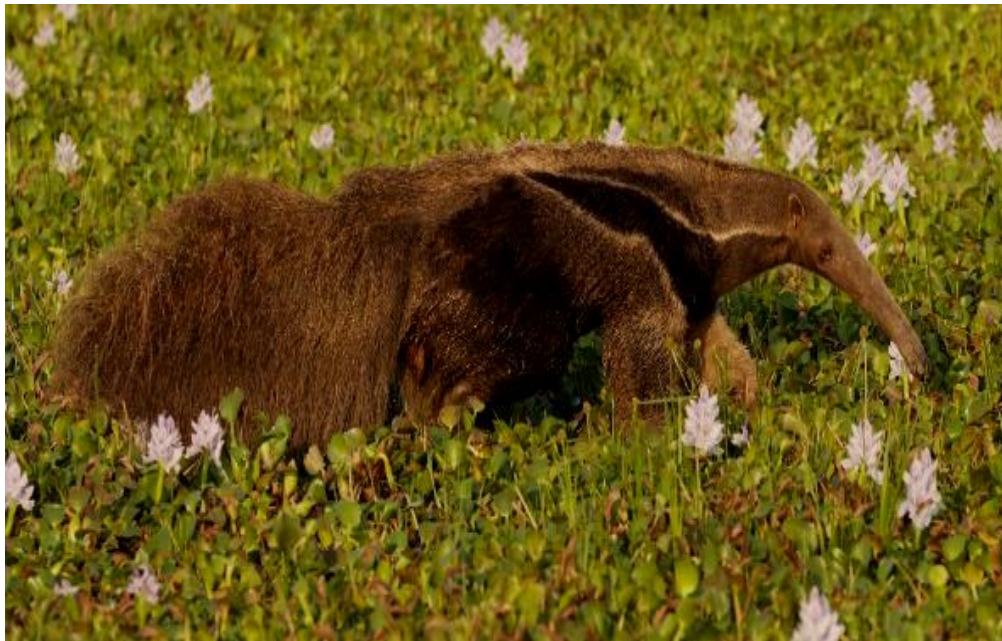
Giant Anteater

Our tour's focus is Reserva Casanare (Juan Solito Lodge) and the contiguous Hato La Aurora, a working cattle ranch where dazzling species such as the Scarlet Ibis share the wetlands with gorgeous Sunbittern and bizarre Hoatzin. You can expect a wealth of tropical birds and some of the easiest and most pleasant birding anywhere. During the tour, we should see more than 200 species, which include such spectacular birds as Jabiru , Orinoco Goose, Great Potoo, Scarlet Macaw, Horned Screamer, Gray-cowled Wood-Rail, Pale-headed Jacamar and many others. Evening spotlighting of mammals, night birds, reptiles, and amphibians from the custom-designed observation truck is superb and is often considered one of the highlights of the tour.