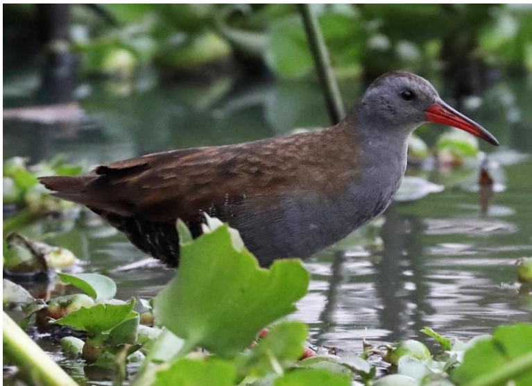
Bogota Rail

Birding Florida Wetland, Laguna Tabacal, and Enchanted Garden. Very early starts are necessary to avoid traffic congestion while leaving Bogota. An early departure (05:00 a.m. approximately) will allow us to reach the Florida wetland in time to search for the secretive endemic Bogota Rail. Also, Andean Duck, Masked Duck, Spot-flanked Gallinule (Endemic subspecies), Silvery-throated Spinetail (Endemic), Subtropical Doradito (Rarely seen), Yellow-hooded Blackbird (Endemic subspecies) and Rufous-browed Conebill. After breakfast, we will head to the Tabacal Lagoon, a wetland located at lower elevation where we have encounter greater diversity including Moustached Puffbird, Bar-crested Antshrike, Blue-lored Antbird, Plain Antvireo (Endemic-