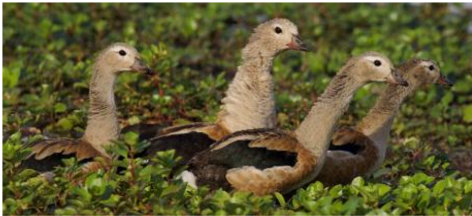
Orinoco Goose

NIGHTS: Ecologde Juan Solito Lodge, Reserva Casanare, Colombian Llanos