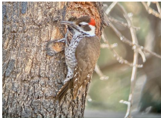
Arizona Woodpecker, Madera Canyon, Arizona

NIGHT: Hampton Inn and Suites, Tucson Airport