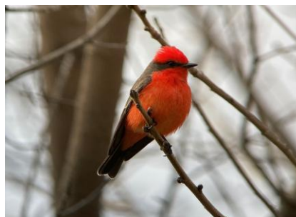
Vermilion Flycatcher, Continental, Arizona, © Barry Zimmer

Participants may plan to depart for home at any time today. If you have time and plan on extending your stay in Tucson, you are encouraged to visit the unique Sonora Desert Museum, west of Tucson. A remarkable exhibit of living flora and fauna can be observed here, all from the Sonora Desert of southern Arizona and northwestern Mexico.