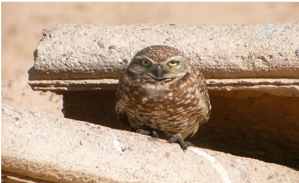
Burrowing Owl, Santa Cruz Flats, Arizona

NIGHT: Hampton Inn and Suites, Tucson Airport