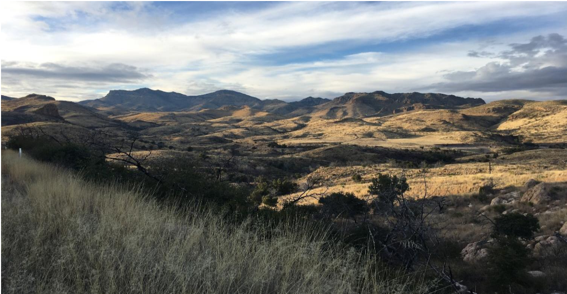
Pajarito Mountains, Arizona

Our exact schedule will be flexible (to allow for rarity searches), but we plan to cover four of the best and most varied regions in this corner of the state, using Tucson as our base for all six nights. Generally mild weather, an abundance of birds, and hopefully some surprising rarities should be in store.