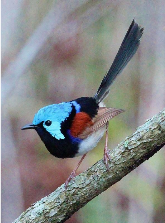
Variegated Fairywren

This morning we will drive south from Sydney to the Royal National Park, a very diverse national park (one of the first declared in the world) with pockets of subtropical rainforest, wet and dry Eucalyptus forests, woodlands and plant-rich sandy heathlands. There are more species of flowering plants here than in the entire United Kingdom.