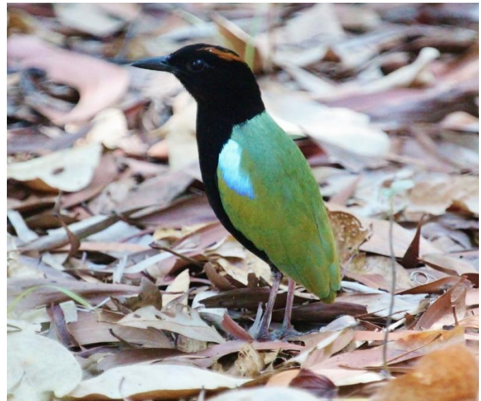
Rainbow Pitta at Howard Springs

World Heritage Kakadu National Park encompasses some 13,000 square kilometers (about 8,000 square miles) of flood plains, paperbark swamps, savannah woodlands and extraordinary sandstone escarpments. The