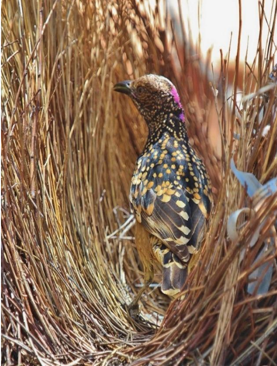
Western Bowerbird working on its bower in Alice Springs

We will depart early this morning for sunrise at Edith Falls. Our target is one of the most sought-after of the Top End birds, the incredibly beautiful and endangered Gouldian Finch. This species, together with Crimson, Double-barred, Long-tailed and Masked Finch inhabit the tropical grassy woodland and will congregate at certain waterholes at first light. This will be our best chance to observe some of these varieties. In addition, there are many other localised and scarce birds in the Katherine district such as Australian Bustard, Chestnut-backed Buttonquail and, with some luck, the very rare Northern Shrike-tit. We will have the afternoon period to explore some different habitat.