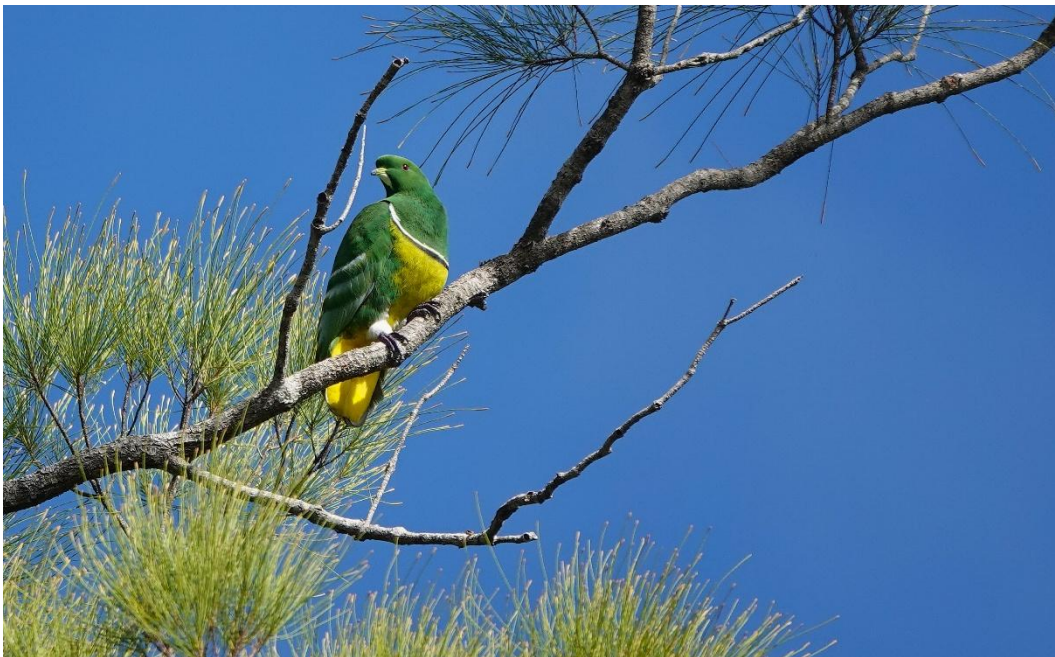
Cloven-feathered Dove from New Caledonia © Max Breckenridge