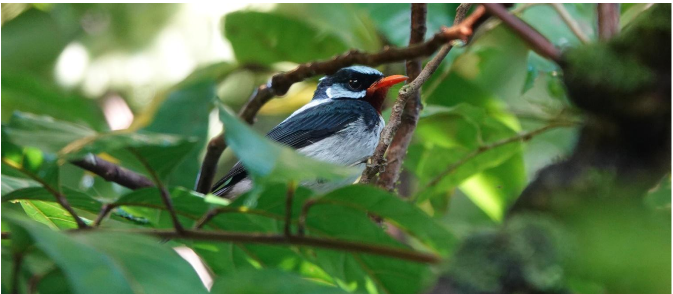
Azure-crested Flycatcher from Taveuni