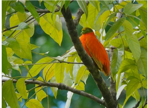
The stunning Orange Dove is only found on the Vanua Levu islands