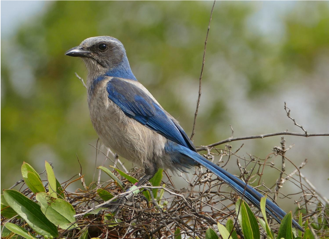
The endemic Florida Scrub-Jay

On this trip, participants will travel a swath of Florida from Gulf beaches to the Space Coast on the Atlantic Ocean, experiencing the wonders of winter birding in one of the country's top birding areas.