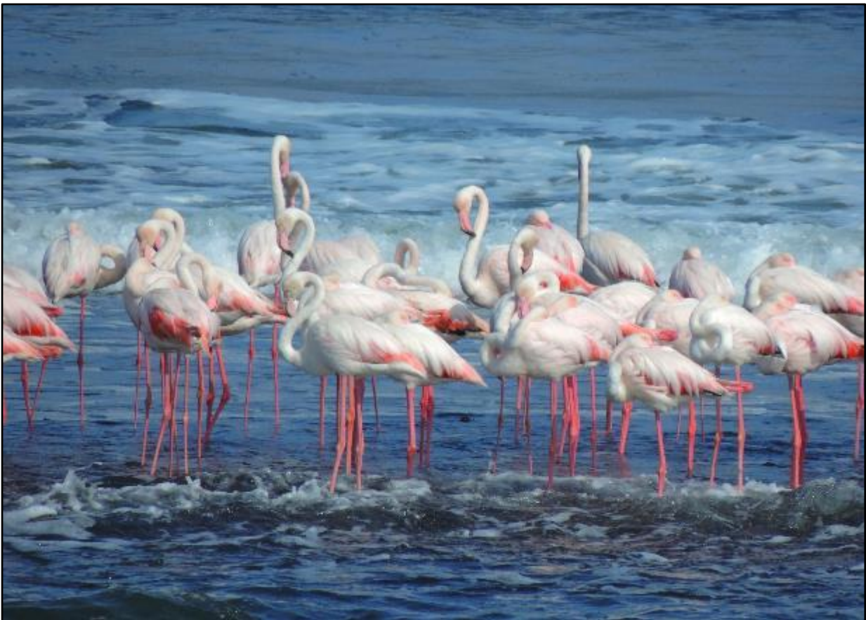
Greater Flamingos at Walvis Bay