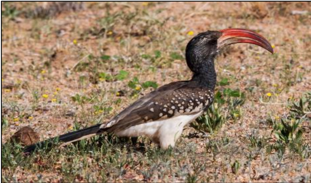
Monteiro's Hornbill

The coastal strip of Namibia is regarded as one of the oldest, and most arid, desert regions in the world—the Namib Desert; and it is characterized by a surprising number of uniquely adapted plant and animal species. On the optional pre-trip, we will explore this fascinating region and look for many of the endemic species that manage to survive in such a harsh environment. Swakopmund, our base for this pre-trip, has a strong German colonial history and character dating back to the days of German South West Africa.