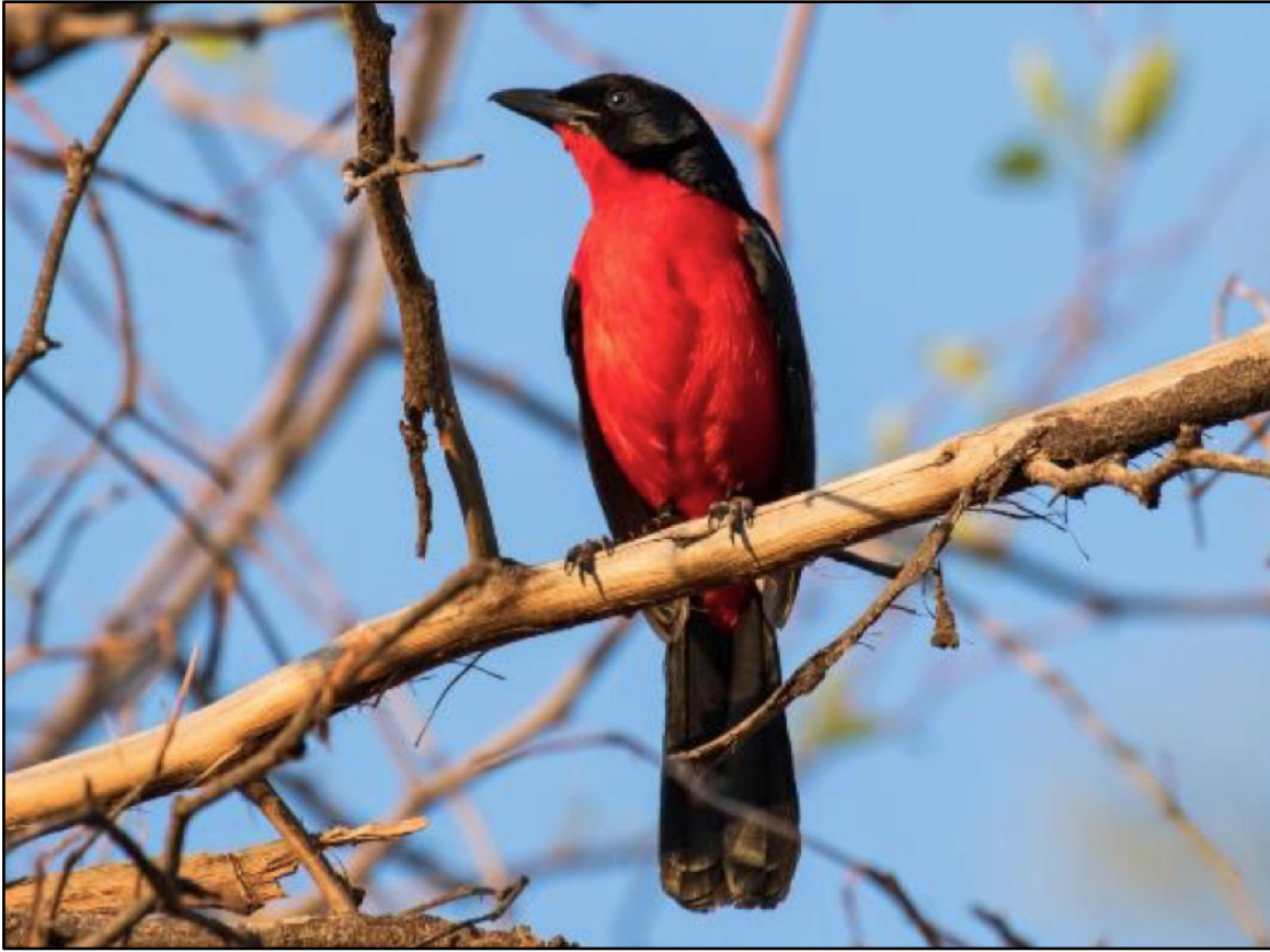
Crimson-breasted Gonolek

Namibia, Botswana, and Zambia—these little-known countries offer some of the greatest wildlife viewing on the African continent. They are huge in size and sparsely populated, with large areas little disturbed by man. We will divide our time between them, contrasting the arid hills and plains of Namibia with the lush swamps and woodland of Botswana’s Okavango Delta region. We will focus on two major areas: Etosha National Park and the Okavango Delta. The tour ends in Livingstone, Zambia, affording participants the opportunity to see Victoria Falls, a roaring wall of water that is one of the great sights of Africa.