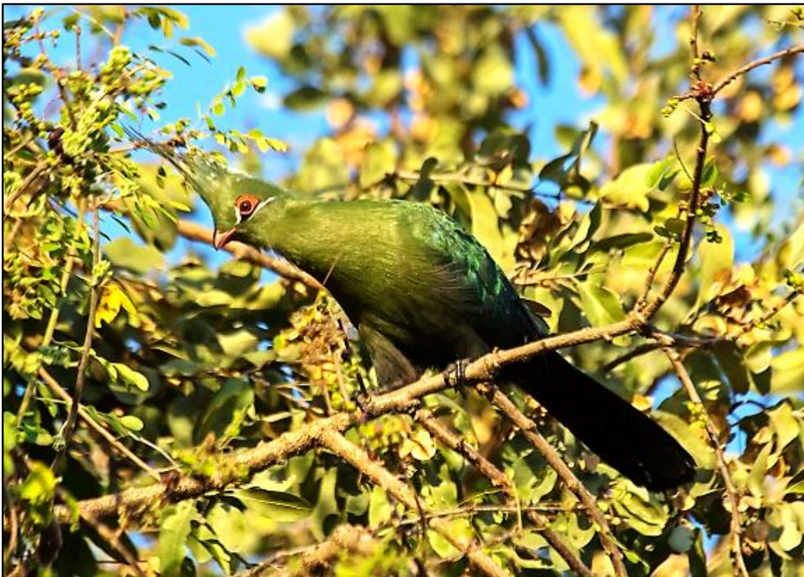
Schalow's Turaco