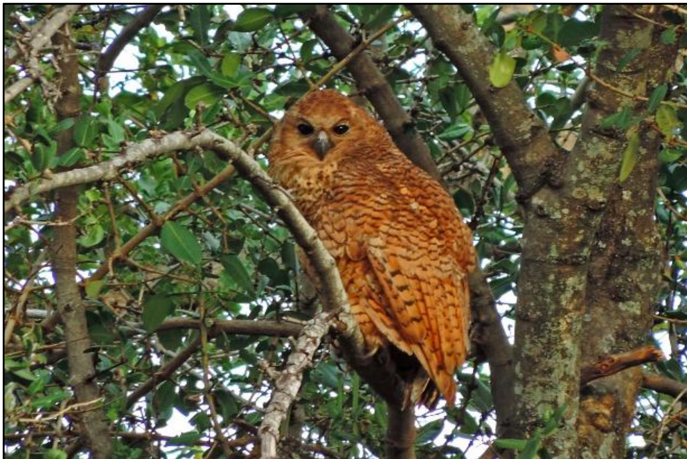
Pel's Fishing-Owl

Pride of place amongst Okavango birds must go to the huge Pel's Fishing-Owl, a magnificent bird that feeds on fish caught by night. We will search for this species around camp and also on our boat trips out on the river. These boat trips will enable us to see a fantastic array of waterbirds, with every bend of the river seeming to offer a new surprise. We may find a sandbar with nesting African Skimmers or a group of colorful Southern Carmine Bee-eaters scouting for a suitable place to start excavating their nests. Hippos and crocodiles plunge into the river at our approach and late in the afternoon we may catch a glimpse of the strange Sitatunga, a swamp-dwelling antelope.