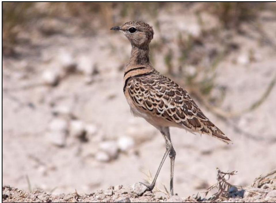
Double-banded Courser

NIGHT: Okaukuejo Camp, Etosha National Park