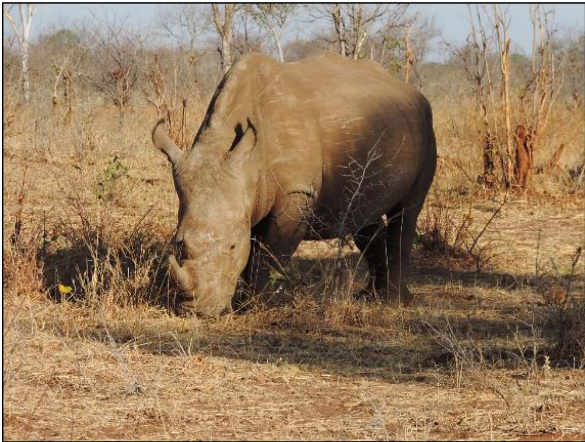
Square-lipped (or White) Rhinoceros