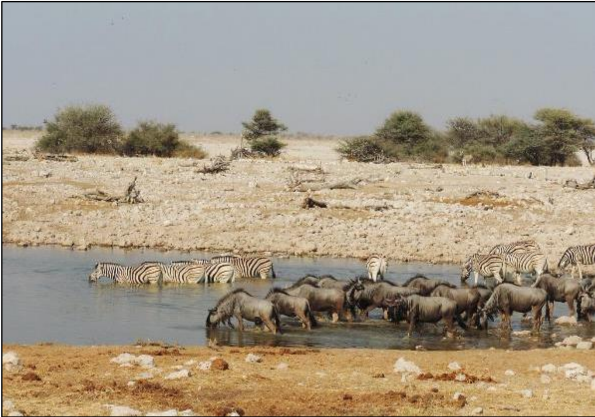
Common Zebra and Blue Wildebeest

“Just as we arrived a Lioness was walking away from the waterhole to join other members of her pride sleeping under a tree. A Tawny Eagle perched atop another tree and soon afterward forty guineafowl came to drink. Minutes later a herd of over a hundred Zebra appeared from our right. Soon the lead Zebra were up to their knees in the water as thirsty members of the herd pressed in from all sides. Suddenly, a Lanner Falcon swooped past and caught a dove. A little later Gemsbok, Wildebeest, and Black-faced Impala moved in to drink. Finally, a pair of Greater Kudu approached the water with extreme caution, but just as they started to drink, one of the Lions raised its head and the Kudu bolted.”