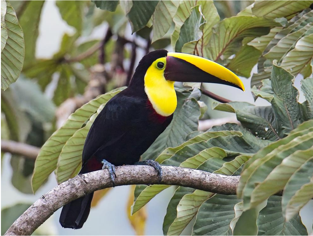
Yellow-throated Toucan

Costa Rica has all the elements that make a country a true birding paradise. Sometimes known as the Switzerland of Central America, this small, safe, and relatively prosperous country is committed to political stability and eager to welcome visitors from around the world. Easy and reliable travel and excellent accommodations combine with a dazzling variety of tropical birds to make this the perfect destination. Costa Rica's list of 950 species—roughly the same number as recorded in the entire Lower 48 of the United States—includes almost 60 hummingbirds, 35 hawks, and 30 wrens, and such classic tropical families as tinamous, guans, potoos, trogons, motmots, and toucans are just as richly represented.