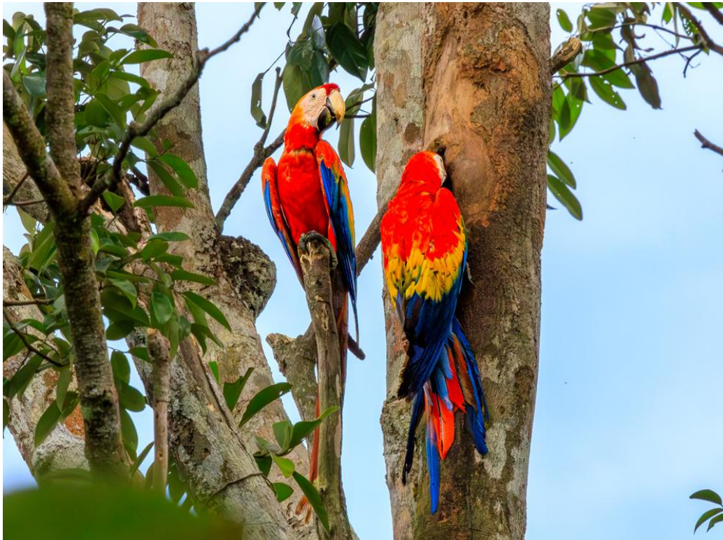
Scarlet Macaws

on the east by Panama and on the west by the Pacific Ocean. Puntarenas and its Osa Peninsula are famously the best place in Costa Rica, and perhaps in all of Central America, for finding the birds of the Pacific slope—including regional endemics found only here and in neighboring Panama and nowhere else in the world.