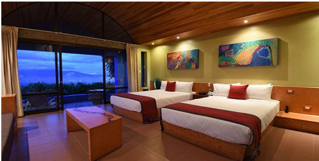
Sunset at Xandari; view from a guest room

On arrival in San José, you will be met in the baggage claim area by a representative of our ground transportation service for the 25-minute transfer to Xandari Resort and Spa, a jewel-like accommodation set in a private nature reserve in Costa Rica's Central Valley. Accommodations in one of the resort's 24 villas will be reserved in your name. After checking in, you are free to rest up or to explore the resort's 40 acres of grounds, comprising tropical gardens, forested trails, and several waterfalls. Over the years, eBirders have recorded nearly 250 bird species on the Xandari property.