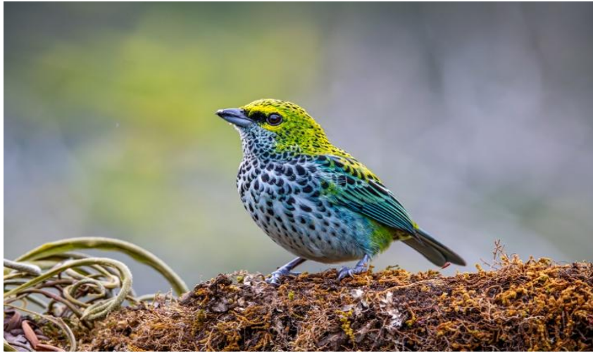
Speckled Tanager

Speckled, Silver-throated, and Bay-headed Tanagers, along with Green Honeycreepers and Scarlet-thighed Dacnis.