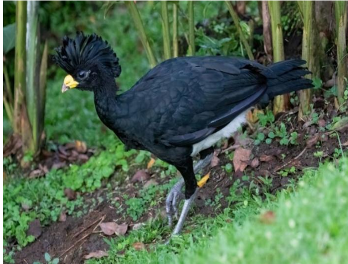
Great Curassow © Keith Bensusan/Cornell Lab of Ornithology

recorded here every month of the year. We'll also hope to tap local knowledge to find the roost site of a Common Potoo, a bizarre nightjar-like bird that spends its days doing its very best to look exactly like a broken tree stub.