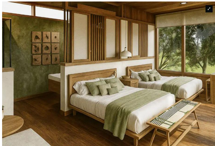
Lapa Rios—Where nature meets comfort!

We will arrive at Lapa Rios in time for lunch, then set out for some afternoon birding. Our luxurious lodge—regarded as the finest eco-lodge resort in Costa Rica—is set inside a private 1000-acre forest preserve, alive with frogs, monkeys, sloths, and more than 300 species of exciting birds. Among our colorful desiderata on this outing are the