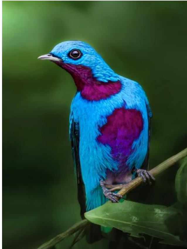
Turquoise Cotinga

On arrival in San José, we will be reunited with any baggage we did not take with us to Lapa Rios, then make the transfer from the domestic terminal to the international terminal.