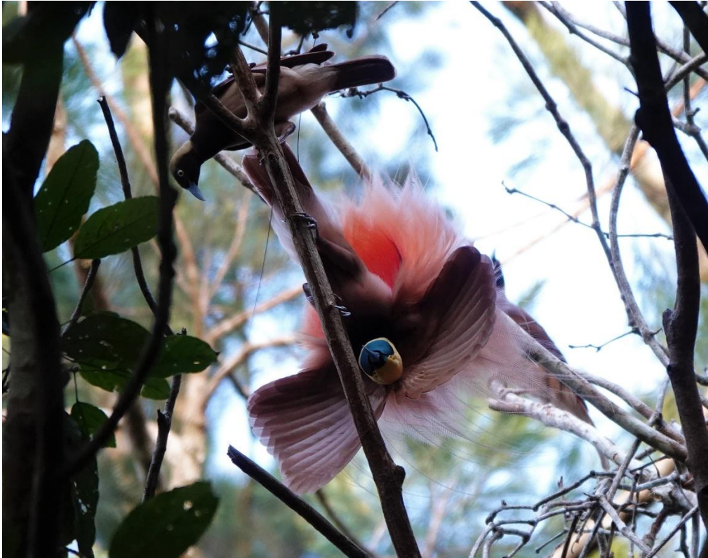
We have a good chance of seeing the extravagant display of the famous Raggiana Bird-of-Paradise

NOTE: Papua New Guinea is very special and one of the most exciting places to visit on earth. However, the internal airline schedule can change frequently. This itinerary is subject to change, dependent on the existing internal air schedules, which may affect the order of the day-to-day activities. Please be assured that the focus of the tour will stay the same and you will still visit all the same areas. It is also important to realize that security can be an issue, and participants are advised not to go birding on their own and always follow the instructions of the leader.