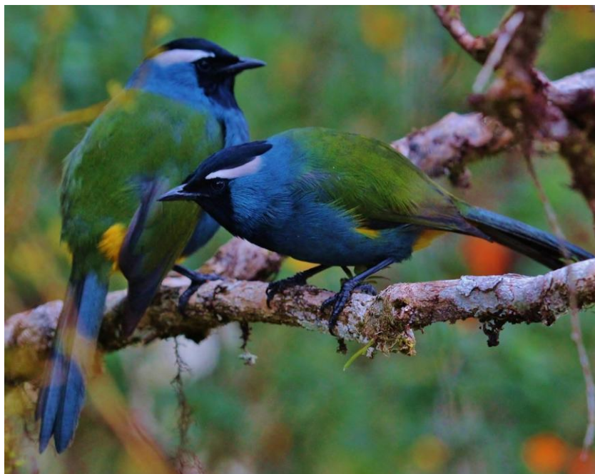
The superb Eastern Crested Berrypecker from Kumul Lodge; representative of a New Guinea endemic bird family