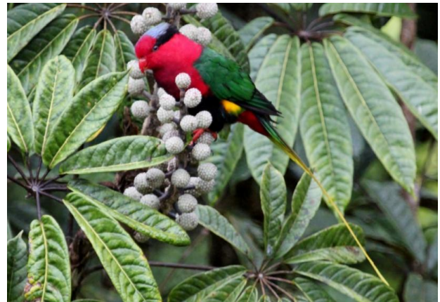
The amazing Stella's Lorikeet is often encountered at Kumul Lodge

Some of the birds we may encounter in and around Kumul Lodge include White-breasted Fruit-Dove, and Papuan Mountain-Pigeon, the handsome Tit and Eastern Crested berrypeckers which comprise a New Guinea endemic family are possible and occasionally we have found the localized Streaked Berrypecker in the valley. With a bit of luck, we should see the spell-binding white tail plumes of the Ribbon-tailed Astrapia , not to mention a bevy of honeyeaters including several very demonstrative species such as the gigantic yodeling Belford's Melidectes , excitable Smoky Honeyeater and glowing Red-collared Myzomela .