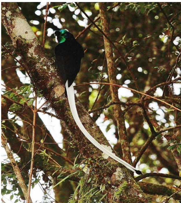
A male Ribbon-tailed Astrapia glows in the dark forest at Kumul Lodge.

Also present are the elusive Bronze Ground-Dove, two species of rather retiring tiger-parrots—Brehm's and the uncommon Painted; five species of lorikeet (Stella's, Plum-faced, Orange-billed, Yellow-billed and in the lower valley sometimes Goldie's); Rufous-throated Bronze-Cuckoo; Archbold's Nightjar (scarce); Mountain Swiftlet; Long-tailed Shrike; Pied Bushchat; Papuan Island Thrush; Blue-capped Ifrita; Regent, Brown-backed and Black-headed whistlers; Rufous-naped Bellbird; Island Leaf-