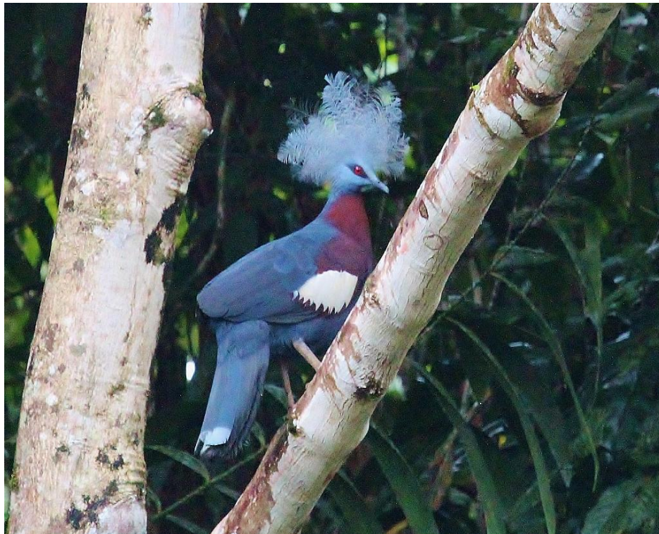
The amazing Sclater's Crowned Pigeon is a chance along the rivers near Kiunga