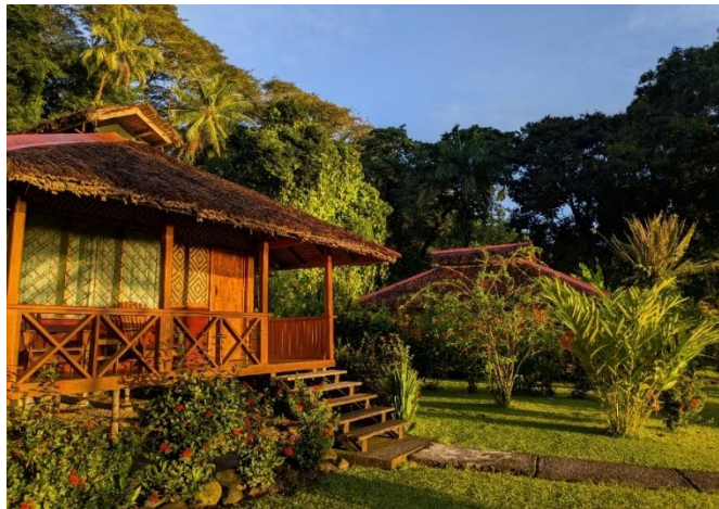
Walindi Plantation Resort lodgings

NIGHTS: Walindi Plantation Resort, West New Britain