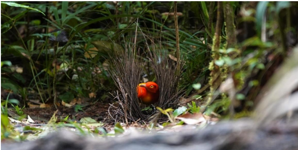
The breathtaking male Flame Bowerbird is always a possibility around Kiunga