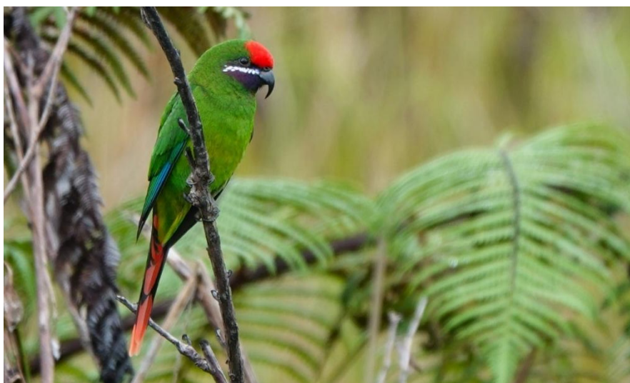
Plum-faced Lorikeet © Max Breckenridge

Other birds we may encounter include four species of rather retiring tiger-parrots; Papuan King-Parrot; Fan-tailed Cuckoo and Rufous-throated Bronze-Cuckoo; Papuan Boobook; Mountain Swiftlet; Mountain Kingfisher; Hooded Cuckooshrike and Black-bellied Cicadabird; Long-tailed Shrike; Pied Bushchat; Papuan Island Thrush; Papuan Logrunner (shy); Island Leaf-Warbler; White-shouldered and perhaps Orange-crowned fairywren; Mountain Mouse-Warbler; three species of diminutive scrubwrens; the songful Brown-breasted Gerygone; Gray Thornbill; Dimorphic, Friendly and Black fantails; the very handsome Black-breasted Boatbill; Canary Flyrobin; Black Pitohui; Papuan and Black sittellas; Mid-mountain and Fan-tailed berrypeckers; Capped and New Guinea white-eyes; Hooded Munia; Mountain Firetail; Mountain Peltops; Great Woodswallow; Black Butcherbird; and with luck, the elusive Archbold's and MacGregor's bowerbirds.