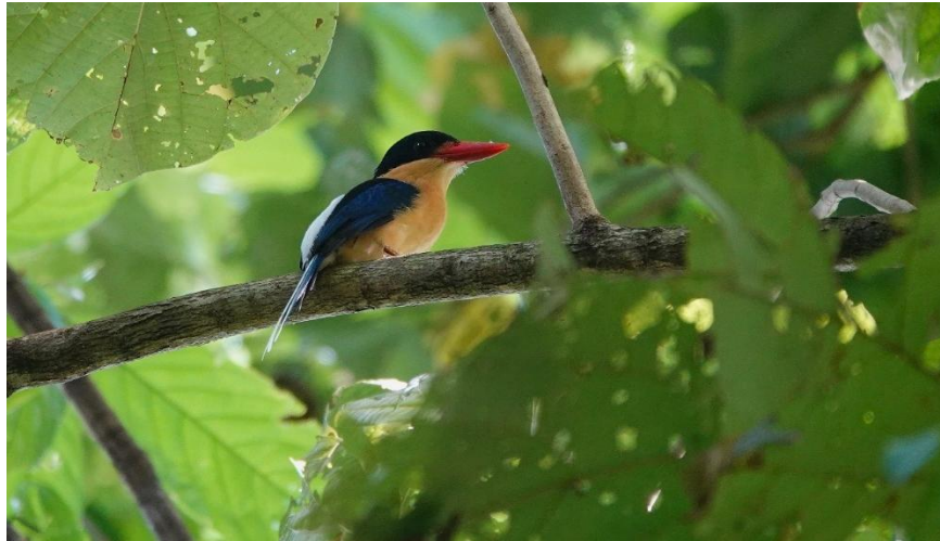
The Black-capped Paradise-Kingfisher is endemic to New Britain © Max Breckenridge