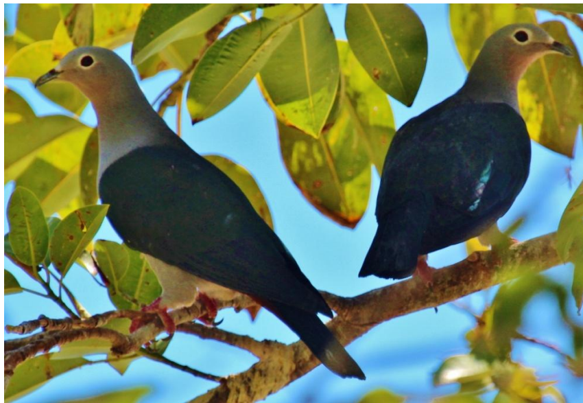
A pair of Island Imperial-Pigeons - set against a turquoise blue ocean in New Britain.

New Britain is the largest of the Melanesian islands in the Bismarck Archipelago. It has a unique bird fauna, reflecting the fact that it has never been in contact with mainland New Guinea, allowing colonizing species to evolve in isolation. It is a superb coral