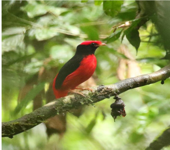
Black-necked Red Cotinga © Brian Gibbons