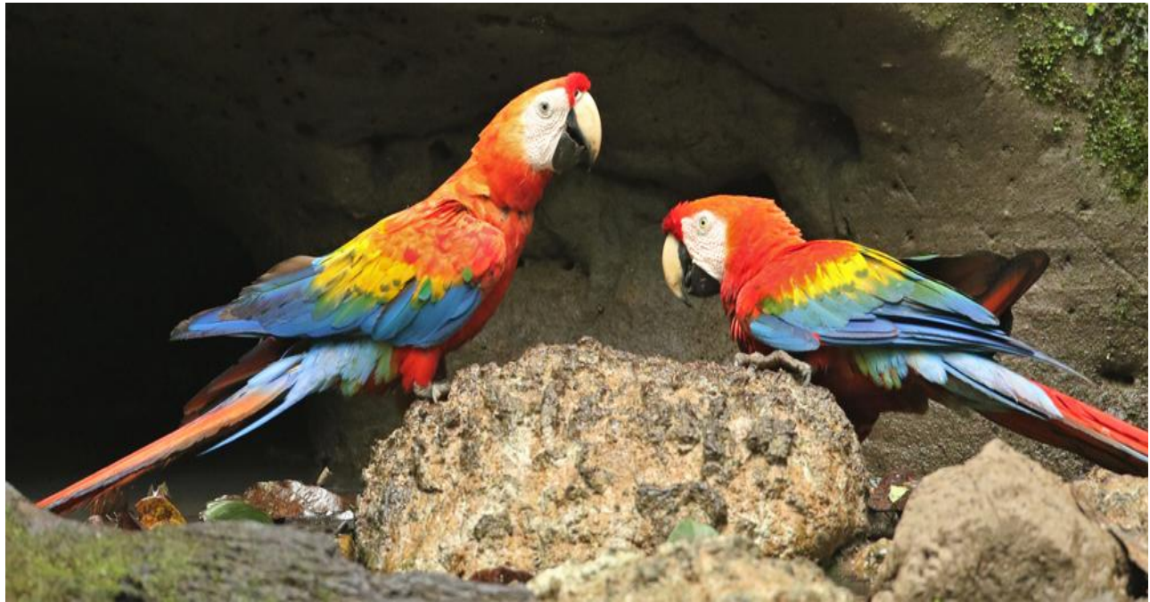
Scarlet Macaws at forest clay lick, Yasuní National Park

From the lush Amazonian rainforests to the high Andean páramos, Ecuador is indeed a special place, boasting good access to birding habitat, unsurpassed scenic splendor, friendly people, and a stable government. Incredibly, over 1,730 species of birds have been recorded in the country, in an area smaller than the state of Colorado! Among them are many of the most spectacular and distinctive Neotropical species. “Ecuador: The Best of Amazonia Short Tour” is designed to sample this magnificent avifauna, immersed in the lush neotropical rainforests of this nation’s upper Amazon Basin. When combined with our back-to-back “Ecuador: Eastern Slope of the Andes” adventure, a full and spectacular range of birding possibilities will offer up a true kaleidoscope of Ecuador’s biodiversity—from the steamy Amazonian lowlands to the gelid snow-capped glacial volcanic peaks of the Andes.