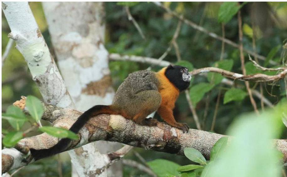
Golden-mantled Tamarin, Napo Wildlife Center

NIGHTS: Napo Wildlife Center, Yasuní National Park