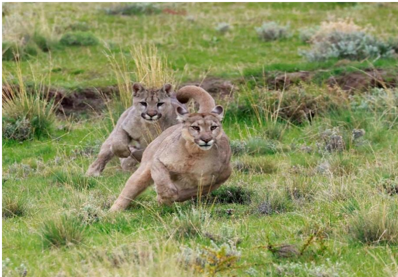
Puma cubs at play

their behavior from the comfort of vehicles. We have enjoyed a 100% success rate in the past with Pumas, often finding multiple cats on our tours.