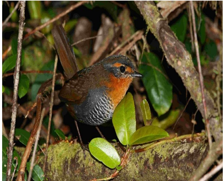
The enigmatic Chucao Tapaculo

We will enjoy a picnic lunch in the park, where we may well be visited by the local Patagonian Gray Fox. As we follow the coast road back to Puerto Montt, we may have an opportunity to study the subtle differences distinguishing the Blackish, American, and Magellanic oystercatchers, which are often found side by side here. We may also encounter Black-faced Ibis, Ringed Kingfisher, Southern Lapwing, Baird's Sandpiper, Peruvian Pelican, or the colorful Austral Negrito.