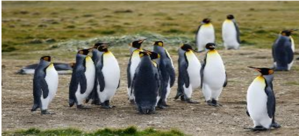
Another trip highlight is the spectacular King Penguin colony on Tierra del Fuego

Arriving on the enchanted island of Tierra del Fuego, the “Land of Fire,” we’ll pass by brackish lakes ablaze with pink-hued flocks of Chilean Flamingos, the avian emblem of Chile’s Patagonia coast.