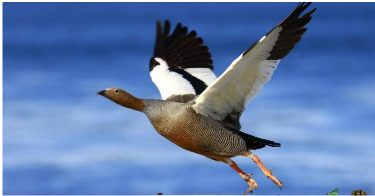
The endangered Ruddy-headed Goose

NIGHT: Hotel Cabo de Hornos, Punta Arenas