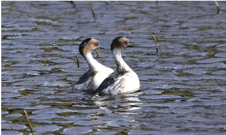
Silvery Grebes displaying

Grebe, Red-gartered Coot, Spectacled and Andean ducks, Magellanic Snipe, and “Austral” Grass Wren.