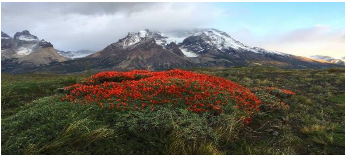
Cuanaco bushes in Torres del Paine National Park

Those eager to experience more of Chile beyond the southern tier of the country can join our connecting tour, Majestic Central Chile. With a different suite of birds and landscapes our objective, we'll travel from the Chilean capital area to the breathtaking Andes and the rich Pacific Coast in pursuit of a host of range-restricted birds. Regional specialties include Humboldt Penguin, Andean Condor, Stripe-backed Bittern, Gray-breasted Seedsnipe, and the remarkable Diademed Sandpiper-Plover. Other highlights include a pelagic trip in the Humboldt Current and a visit to the house of Pablo Neruda, perhaps Chile's most famous poet.