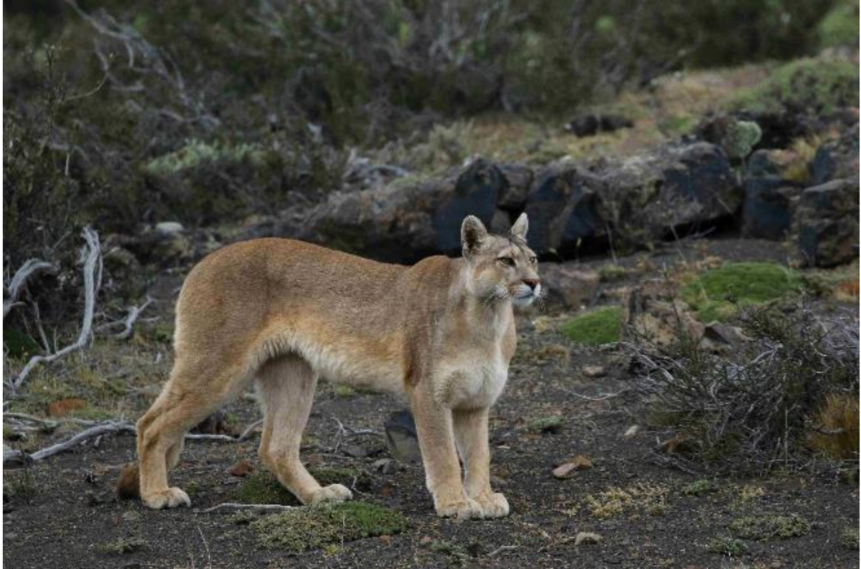
Puma, Torres del Paine National Park

A Puma hunting Guanaco against a backdrop of snow-capped spires, the raucous antics of a King Penguin colony, a pair of Magellanic Woodpeckers in a towering southern beech forest, fine wine in a comfortable lodge: Where else but Chile!