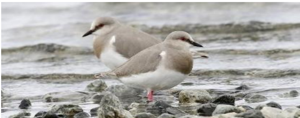
The sought-after and unusual Magellanic Plover is the only species in its family.

NIGHT: Hotel Remota Patagonia Lodge, Puerto Natales