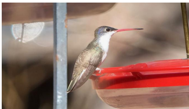
Violet-crowned Hummingbird, Patagonia, Arizona

A longer drive today will lead us to the birdy Sulphur Springs Valley. This area is renowned for its great raptor viewing with uncommon species such as Ferruginous Hawk and Prairie Falcon likely during the course of the day. Red-tailed Hawks and Northern Harriers abound, and there should be a sprinkling of accipiters as well. Toward the southern end of the valley large concentrations of Sandhill Cranes (about 20,000) gather around Whitewater Draw. The sights and sounds of thousands of