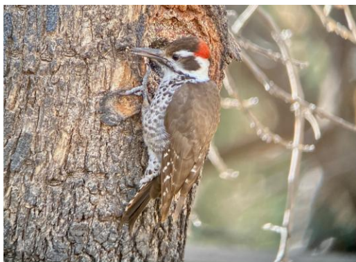
Arizona Woodpecker, Madera Canyon, Arizona

NIGHT: Hampton Inn and Suites, Tucson Airport