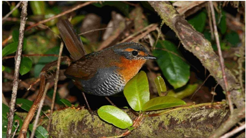
The enigmatic Chucao Tapaculo

We will enjoy a picnic lunch in the park, where we may well be visited by the local Patagonian Gray Fox. As we follow the coast road back to Puerto Montt, we may have an opportunity to study the subtle differences distinguishing the Blackish, American, and Magellanic oystercatchers, which are often found side by side here. We may also encounter Black-faced Ibis, Ringed Kingfisher, Southern Lapwing, Baird's Sandpiper, Peruvian Pelican, or the colorful Austral Negrito.