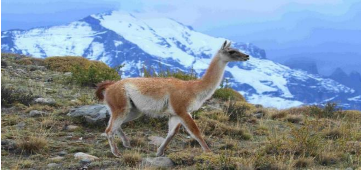
Guanaco, the Puma's favored prey, at Torres del Paine National Park