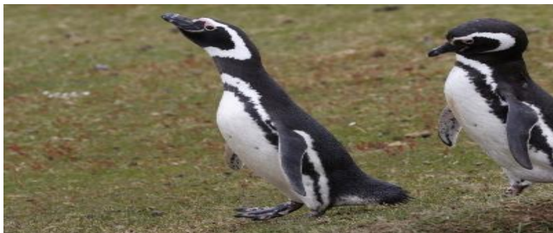
Magellanic Penguins

We will start the day with a boat trip to Magdalena Island in the Strait of Magellan, home to a thriving colony of Magellanic Penguins. It is an hour to the main island, where a well-designed and well-marked trail lets us walk through the colony without disturbing it. We will gain close-up insights into penguin life, including the birds' strategies for coping with the ever-present Chilean Skuas and Kelp Gulls, which prey on eggs and chicks. We will also enjoy the antics of a large colony of South American Terns in full breeding plumage. Common Miners are often seen as well.