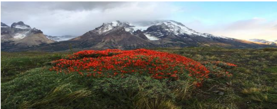
Cuanaco bushes in Torres del Paine National Park

Those eager to experience more of Chile beyond the southern tier of the country can join our connecting tour, Majestic Central Chile. With a different suite of birds and landscapes our objective, we'll travel from the Chilean capital area to the breathtaking Andes and the rich Pacific Coast in pursuit of a host of range-restricted birds. Regional specialties include Humboldt Penguin, Andean Condor, Stripe-backed Bittern, Gray-breasted Seedsnipe, and the remarkable Diademed Sandpiper-Plover. Other highlights include a pelagic trip in the Humboldt Current and a visit to the house of Pablo Neruda, perhaps Chile's most famous poet.