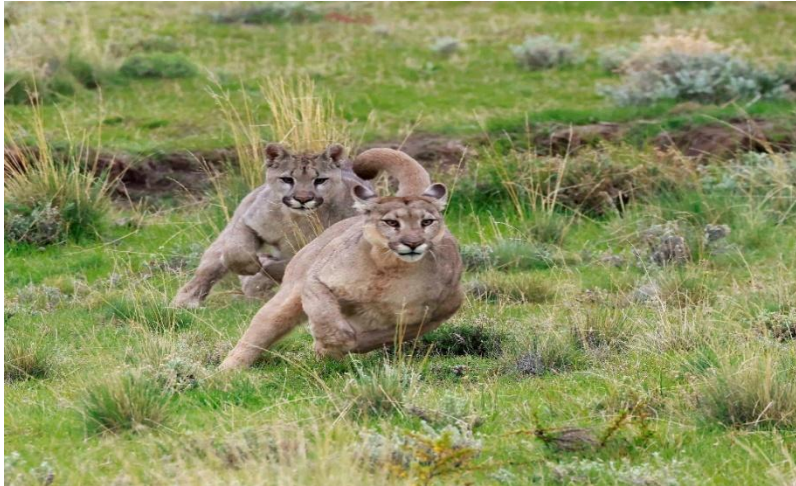
Puma cubs at play

We will embark on our 4x4 “safari” or take a longer hike to follow the hunting cats; we are normally able to observe their behavior from the comfort of vehicles. We have enjoyed a 100% success rate in the past with Pumas, often finding multiple cats on our tours