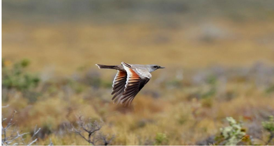
Chocolate-vented Tyrant