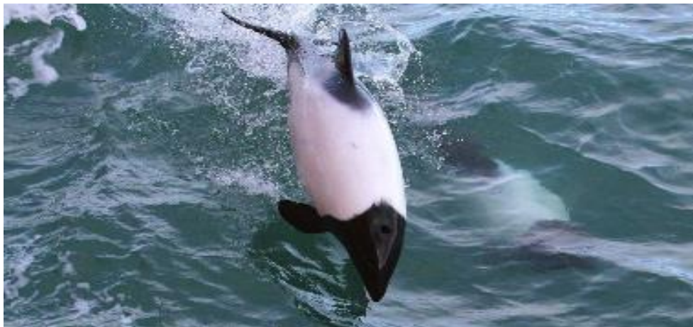
Commerson's Dolphins

After an early breakfast, we'll recross the Strait of Magellan, giving us a chance to spot the stunning Commerson's Dolphin. Once back on the mainland, we will head north on a well-maintained road leading through coastal grassland and barren steppe on our way to Punta Arenas for the night.