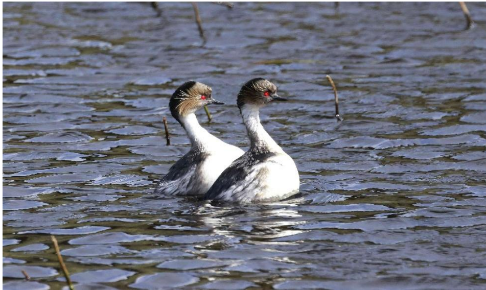
Silvery Grebes displaying

Short-eared Owl, Silvery Grebe, Red-gartered Coot, Spectacled and Andean ducks, Magellanic Snipe, and “Austral” Grass Wren.