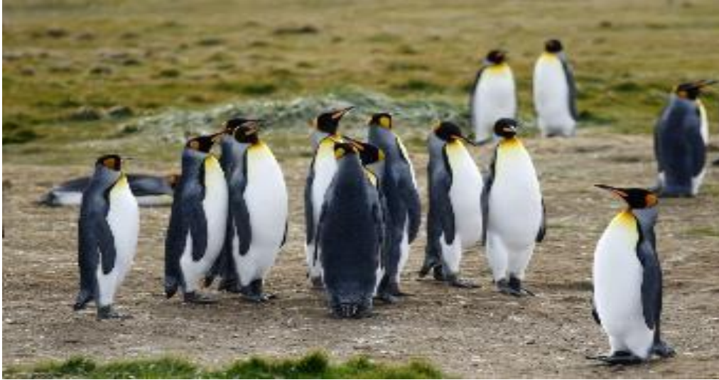
Another trip highlight is the spectacular King Penguin colony on Tierra del Fuego

A good dirt and asphalt road takes us across the remote landscape to Bahía Inútil and a close encounter with a thriving colony of King Penguins; there are more than 130 birds in this colony, which is still increasing. We will enjoy these marvelous birds' fascinating behavior from a blind at close range. Fluffy young birds should be in evidence, products of a breeding cycle longer than that of any other bird: it takes 14–16 months to fledge a single chick. Because of the length of the chick-rearing cycle, adults can rear only two chicks every three years. In the winter, chicks may fast from one to five months. Double-banded Plovers also breed here, and we should keep a sharp eye out for the Patagonian Tuco-Tuco, an odd subterranean rodent.