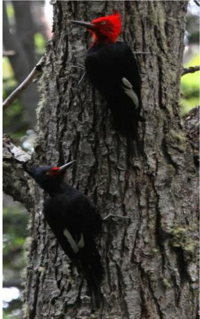
Magellanic Woodpeckers

We'll travel to Torres del Paine National Park, where Pumas are often seen at close range and are fearless due to the lack of hunting and persecution! Imagine observing them stalk their prey amid glistening glaciers, turquoise lakes, and hillsides ablaze with scarlet, orange, and yellow wildflowers. We will also enjoy herds of wild Guanaco, flocks of Lesser Rhea, and majestic Andean Condors and Magellanic Woodpeckers.