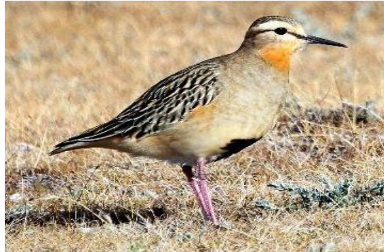
Tawny-throated Dotterel

The barren steppe is also the breeding ground of stunning Tawny-throated Dotterels. We may also be so lucky as to hear the songs of Least Seedsnipes echoing overhead as they perform their aerial displays, or to encounter the uncommon Austral Canastero serenading us from the stunted brush. Other likely species along our route include the handsome Cinnamon-bellied Ground-Tyrant, and we may spend time looking for both Elegant-crested and Patagonian tinamous in areas of taller grass.