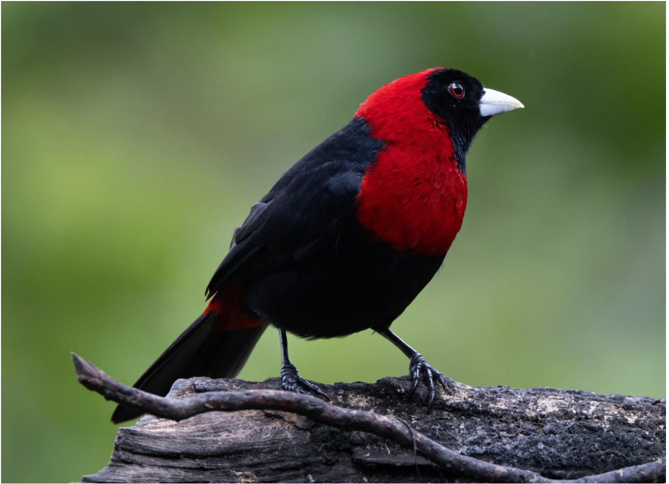
Crimson-collared Tanager, Ramphocelus sanguinolentus.