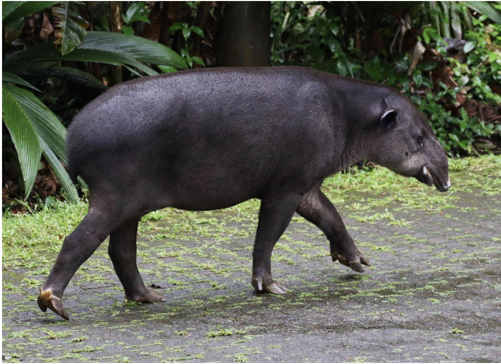
Baird's Tapir. Tapirus bairdii.

The forest edge is not far away, and we're sure to spot some spectacular large birds sitting up in the crowns of the trees. These may include Crested Guan, Mealy and White-crowned parrots, Gartered Trogon, Keel-billed and Yellow-throated toucans, Collared Aracari, Snowy Cotinga, Montezuma Oropendola, Yellow-tailed Oriole and even Great Green Macaw. Close to the station itself are dense secondary thickets with young trees and vine-tangled forest edge, the preferred habitat for birds like Rufous-tailed Jacamar; Great and Fasciated antshrikes; Long-tailed Tyrant; White-collared Manakin; Black-throated and Cabanis' wrens; honeycreepers; Plain-colored, Crimson-collared and Scarlet-rumped (Passerini's) tanagers; or Black-headed and Buff-throated saltators. Hummingbirds visit the flowering shrubs, including Bronze-tailed Plumeleteer, Rufous-tailed Hummingbird and White-necked Jacobin. We will also search for an absolutely stellar line-up of tanagers, such as Emerald, Silver-throated, Speckled, Spangle-cheeked, Blue-and-gold, Black-and-yellow and Tawny-crested, as well as White-throated Shrike-Tanager. Many other birds also occur, but for various reasons, the chances of seeing them are vanishingly small. Nevertheless, just being where they occur and knowing that one of them could turn up is exciting. This remarkable group includes Tiny Hawk, Violaceous Quail-Dove, Rufous-vented Ground-Cuckoo, Black-crowned Antpitta, and Bare-necked Umbrellabird.