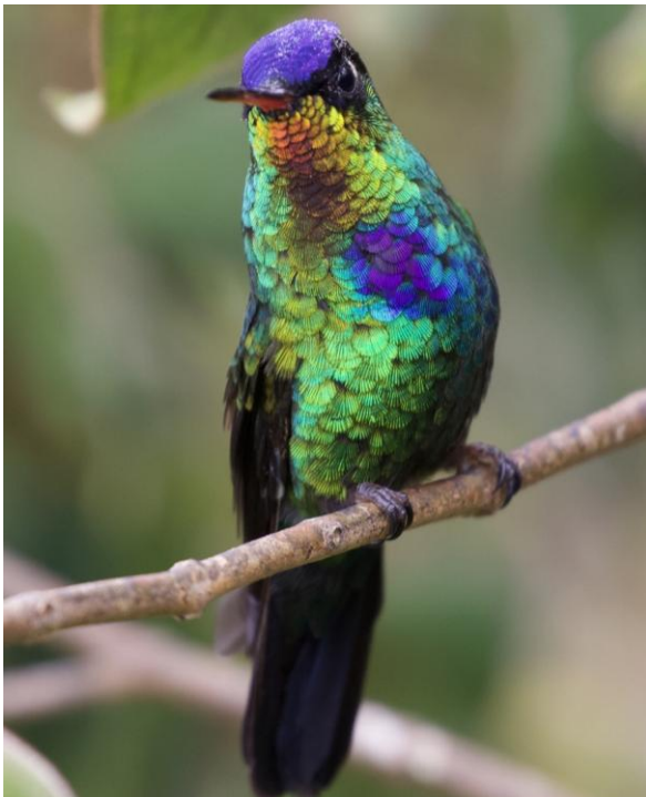
Fiery-throated Hummingbird, Panterpe insignis.