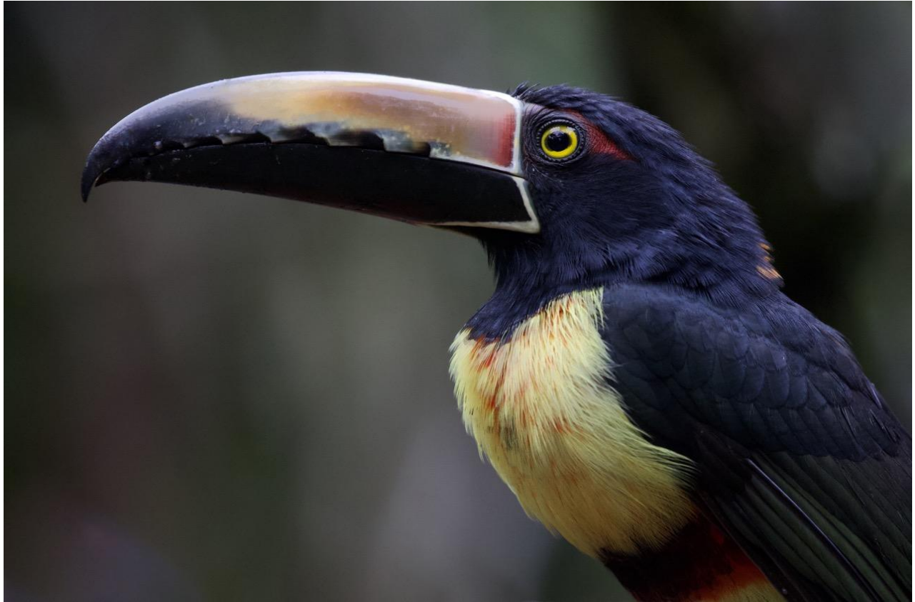
Collared Aracari. Pteroglossus torquatus.