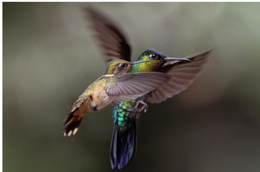
Volcano and Fiery-throated Hummingbirds.

search for birds not found at higher elevations and include several tyrant-flycatchers, parrots, parakeets and a possibility to enjoy the unique Snowy Cotinga. This tour is one in our series of Relaxed & Easy tours. These tours are appropriate for participants who want a slower paced tour, with somewhat fewer hours in the field and lighter physical activity. For most of the tour, there is a later start in the morning (typically between 6.00 to 6:30 AM), some days with a break after lunch and a shorter afternoon outing. They involve shorter walks, usually less than a mile, and avoid difficult terrain.