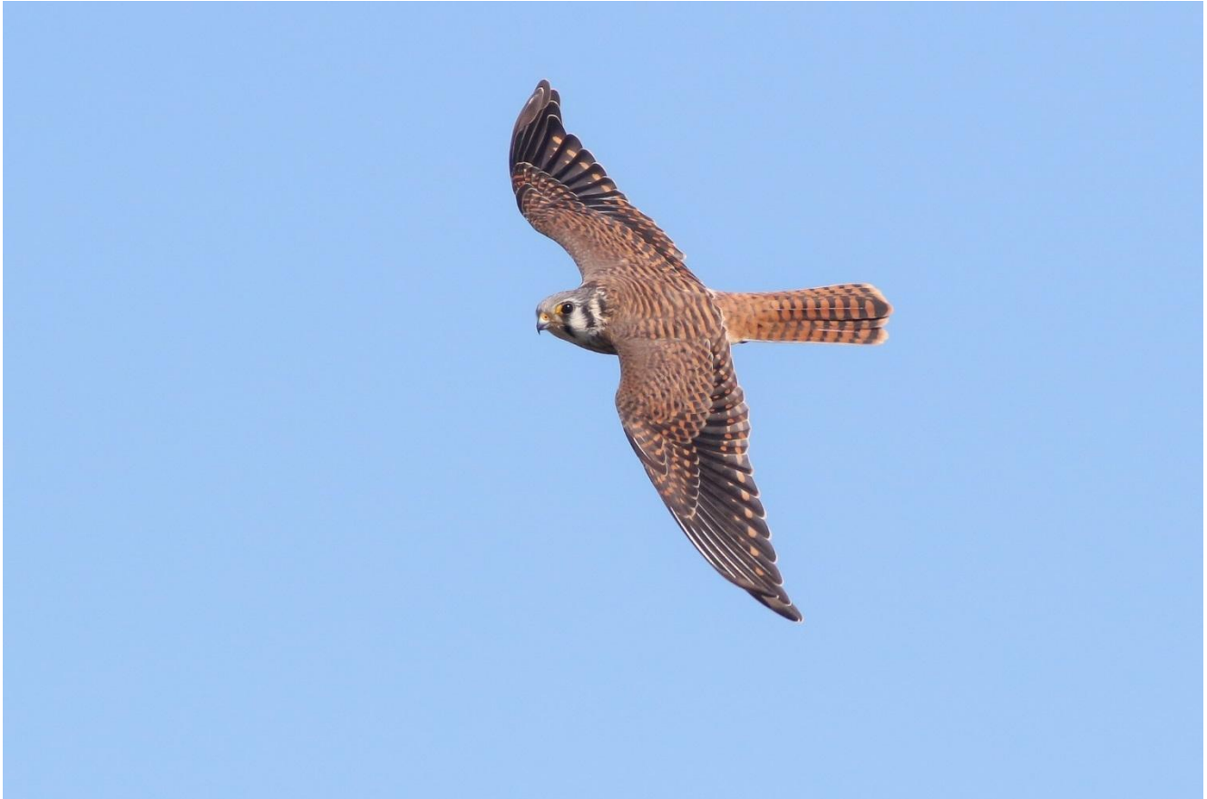
American Kestrel

Along the Atlantic Coast, fall is perhaps the most enchanting of seasons. Summer has lifted, the harvest is in, and the air carries a promise of winter to come. But there is a last warm chance to savor the abundance of nature. Thousands of birds, their brief annual residence in the north completed, make their way down the eastern seaboard, pausing only to feed and rest. The feeling is very different from that of the spring migration, with its joyful song and sprightly breeding dress. However, this autumnal journey has a majesty and splendor that is truly unique.