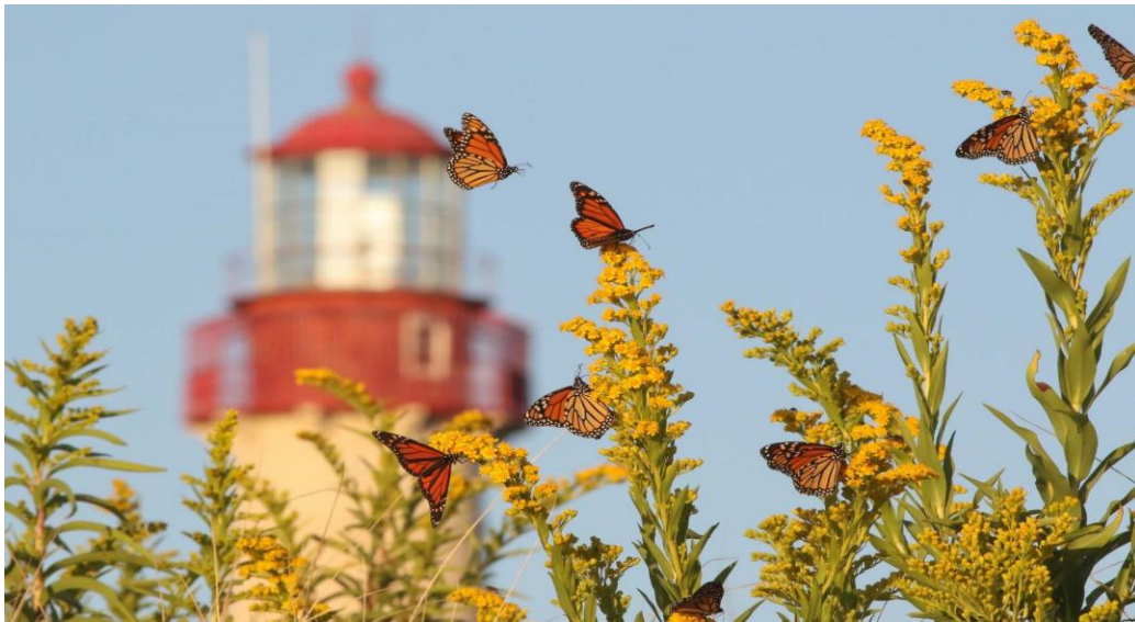
Monarchs on Seaside Goldenrod