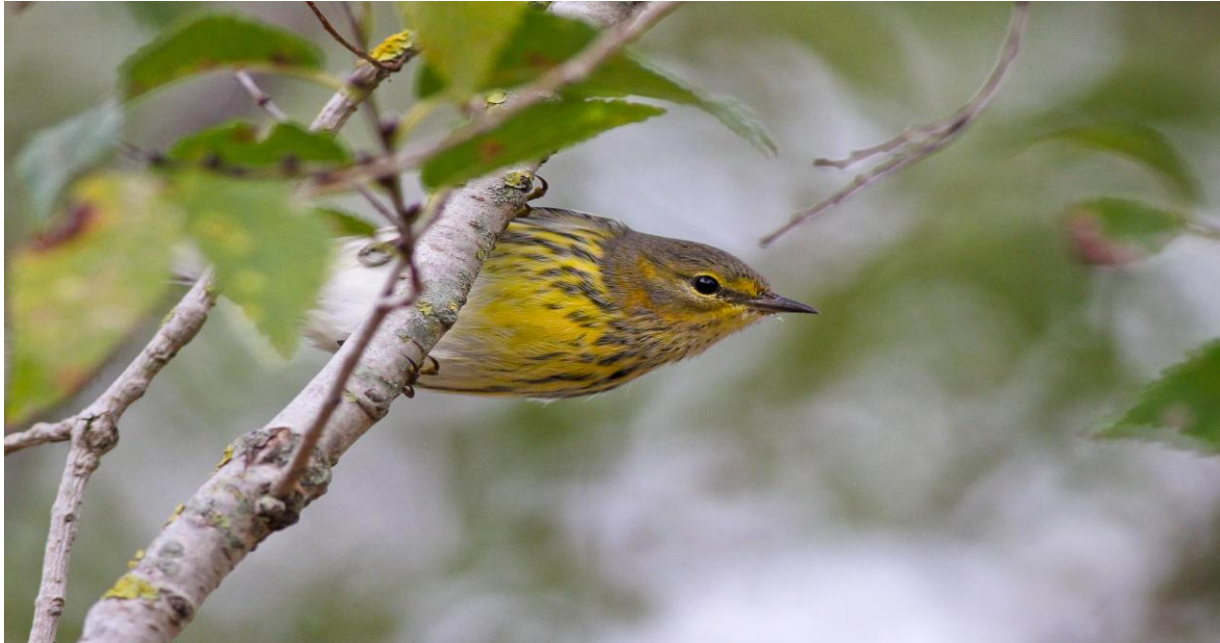
Cape May Warbler

NIGHT: Home2 Suites, Philadelphia Airport