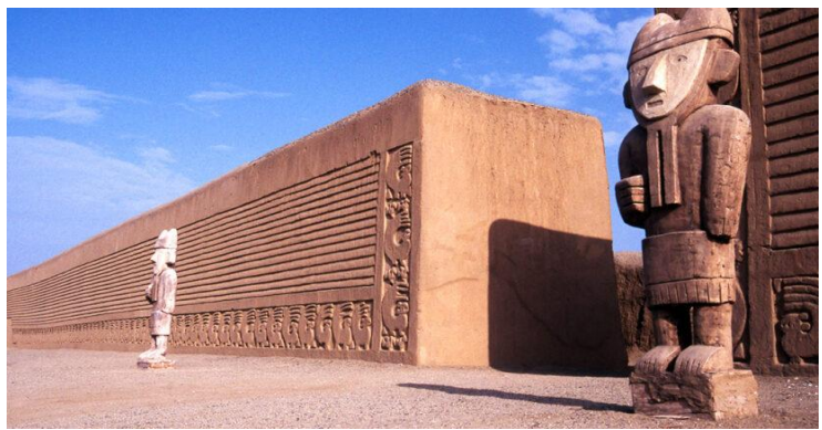
Chan Chan, largest mud city in the world

We'll enjoy a full day exploration of the charming city of Trujillo and its nearby archaeological wonders beginning with a short walking tour of its historical center visiting the Main Plaza, its Cathedral, and the neoclassical and baroque style mansion homes such as the Urquiaga and Bracamonte. Chan-Chan, the biggest pre-Hispanic urban center built entirely with mud bricks is located only three miles northeast of the city and was declared a World Heritage Site by UNESCO back in 1986. This amazing complex features plazas, workshops, streets, walls and pyramidal temples. Its enormous walls are profusely decorated with reliefs of geometric figures, zoomorphic stylizations and mythological creatures.