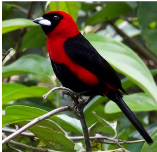
Masked Crimson Tanager

The airy, breezy ship and air-conditioned cabins mitigate the effects of even the hottest days, and visitors soon discover that insects and mosquitoes, far from being the torment they are imagined, are restricted or no problem at all. This trip, which is based aboard a relatively small river boat offers perhaps the most