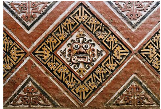
Temple of the Sun and Moon

In the afternoon we'll explore the Temples of the Sun and the Moon. These pyramid-like structures were constructed by the sophisticated Moche people who ruled the northern coast between A.D 100 and 800. Their walls are plastered with distinctive murals depicting the Moche creator God Ai Apaec, the temple is thought to have been used for religious and ritual ceremonies. At the end of this exciting day, we will enjoy a delicious dinner at the hotel restaurant.