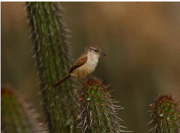
Cactus Canastero © A Whittaker

On our last morning, we will visit a nearby and newly created private reserve known as Lomas Cerro de Campana (45 mins drive from Trujillo). The main objective of this reserve is to protect the delicate coastal hills and lomas ecosystems with its unique flora and fauna. The vegetation develops on the slopes facing the sea, favoring the condensations of mist brought by winds from the south and southwest.