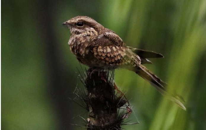
Ladder-tailed Nightjar

We will be spending the morning exploring slowly up one of the hundreds of small creeks and tributaries that feed the main Ucayali rivers here. Continuing some of the activities that we began our first afternoon in the channel of the Amazon, we will be looking for a number of river island bird specialist species that live almost exclusively in the various early successional stage vegetation