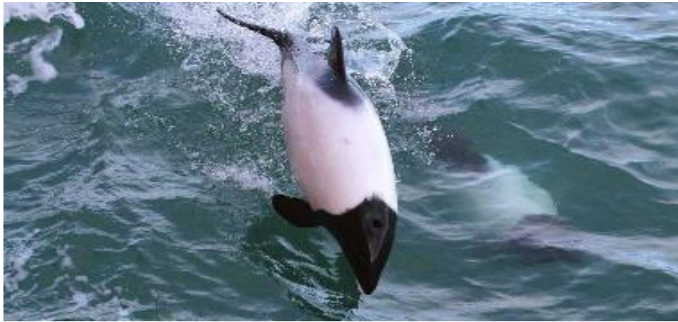
Commerson's Dolphins

maintained road leading through coastal grassland and barren steppe on our way to Punta Arenas for the night.