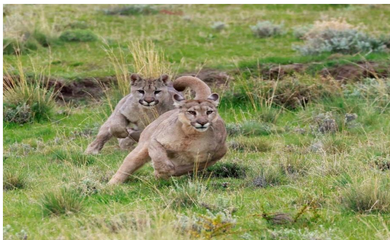
Puma cubs at play

We have two full days to enjoy this incredible location, its special birds, and its wild Pumas. Simply going to a place and expecting to see wild Pumas is a recent phenomenon, inconceivable until a decade ago. This is all possible thanks to an excellent tracking system. We will embark on our 4x4 “safari” or take a longer hike to follow the hunting cats; we are normally able to observe their behavior from the comfort of vehicles. We have enjoyed a 100% success rate in the past with Pumas, often finding multiple cats on our tours