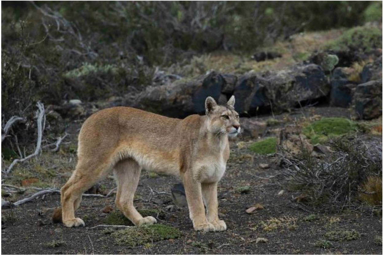
Puma, Torres del Paine National Park

A Puma hunting Guanaco against a backdrop of snow-capped spires, the raucous antics of a King Penguin colony, a pair of Magellanic Woodpeckers in a towering southern beech forest, fine wine in a comfortable lodge: Where else but Chile!