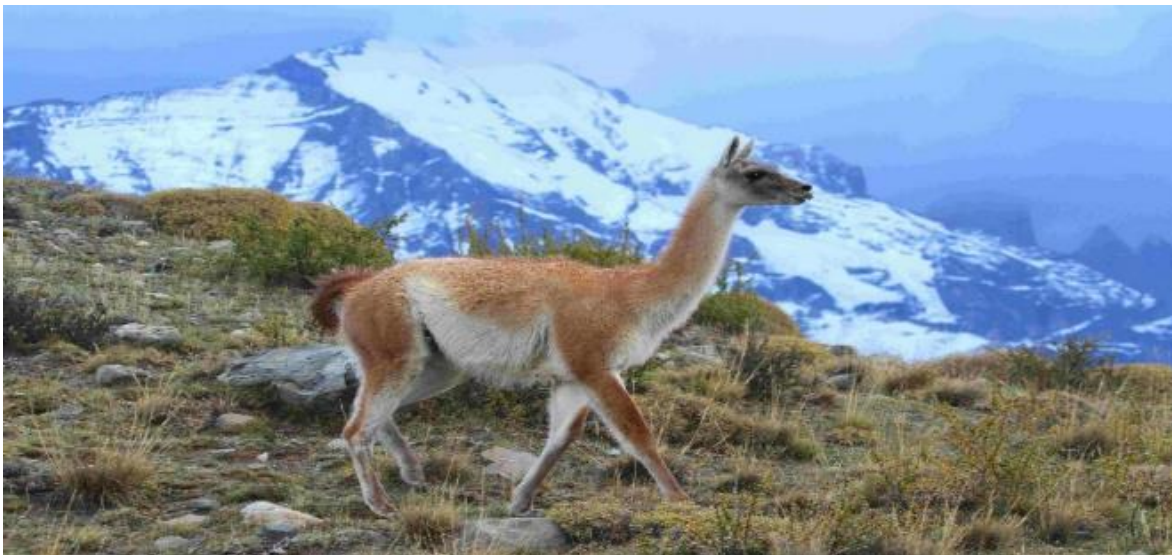
Guanaco, the Puma's favored prey, at Torres del Paine National Park

NIGHTS: Estancia El Ovejero Patagónico, Cerro Castillo, Torres Del Paine National Park