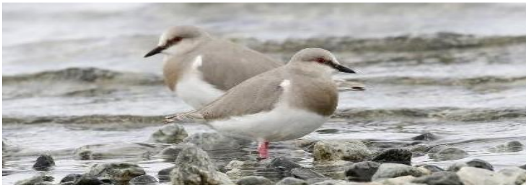
The sought-after and unusual Magellanic Plover is the only species in its family.

NIGHT: Hotel Remota Patagonia Lodge, Puerto Natales