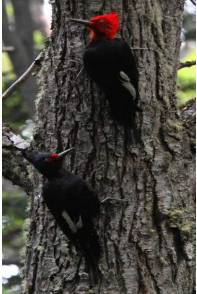
Magellanic Woodpeckers

and the giant walls of the Paine Massif, Ashy-headed, Upland, and endangered Ruddy-headed geese breed among hordes of other waterfowl. We'll search for the highly sought and rare Magellanic Plover and colorful Rufous-chested and Tawny-throated dotterels. Magdalena Island is home to a thriving colony of Magellanic Penguins. Always a highlight is our opportunity to visit a rookery of King Penguins, complete with fluffy chicks.