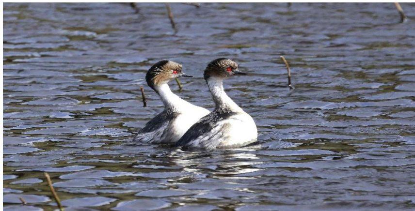
Silvery Grebes displaying

Famous for its astonishing scenery, with photo opportunities at every bend in the road, Torres del Paine also hosts special birds. We will venture to the myriad lakes, ponds, and reed-fringed pools of the east side of the park, seeking waterfowl and the recently rediscovered Austral Rail. Other birds of the area include Andean Condor, Cinereous Harrier, Short-eared Owl, Silvery Grebe, Red-gartered Coot, Spectacled and Andean ducks, Magellanic Snipe, and “Austral” Grass Wren.