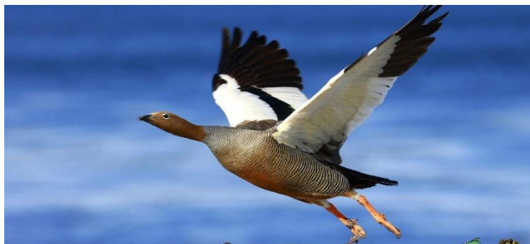
The endangered Ruddy-headed Goose

In the midafternoon, we will drive south toward the San Juan River, a rich wetland system that provides chances for a variety of waterfowl. Our target species here is the highly sought and endangered Ruddy-headed Goose, but we are also likely to enjoy Upland and Ashy-headed geese, Flightless Steamer-Ducks, Crested Duck, Yellow-billed Pintail, Chiloé Wigeon, and a variety of shorebirds including Magellanic Oystercatcher and Magellanic Snipe. Even Short-eared Owls are possible here. Imperial and Magellanic cormorants breed on the old town pier. Please note that we may not go all the way to the reserve if we are fortunate enough to encounter Ruddy-headed Geese en route.