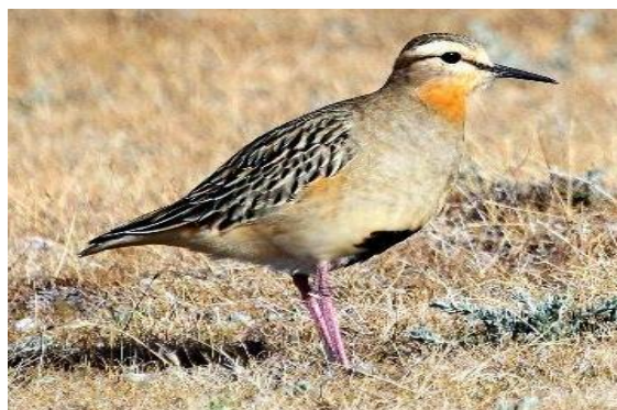
Tawny-throated Dotterel

The barren steppe is also the breeding ground of stunning Tawny-throated Dotterels. We may also be so lucky as to hear the songs of Least Seedsnipes echoing overhead as they perform their aerial displays, or to encounter the uncommon Austral Canastero serenading us from the stunted brush. Other likely species along our route include the handsome Cinnamon-bellied Ground-Tyrant, and we may spend time looking for both Elegant-crested and Patagonian tinamous in areas of taller grass.