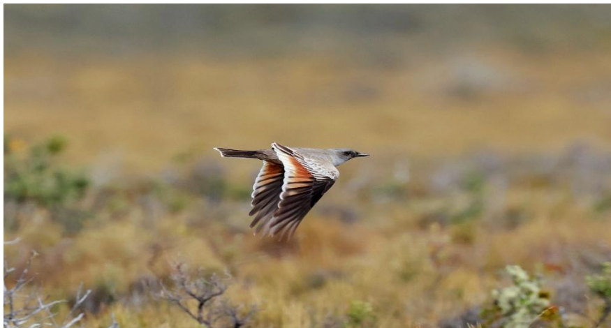
Chocolate-vented Tyrant

Late afternoon we will find us in the remote town of Cerro Sombrero. Sandy areas here are home to the local subspecies of Common and Short-billed miners, Buff-winged Cinclodes, Patagonian Yellow-Finch, and maybe our first beautiful Cinnamon-bellied Ground-Tyrant or uncommon, striking Chocolate-vented Tyrant, with its long, kestrel-like wings.