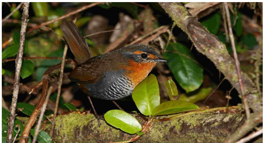
The enigmatic Chucao Tapaculo

study the subtle differences distinguishing the Blackish, American, and Magellanic oystercatchers, which are often found side by side here. We may also encounter Black-faced