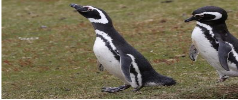
Magellanic Penguins

After an hour's brisk stroll, we will be served a very welcome hot chocolate, then "set sail" for an islet with a noisy colony of South American Sea Lions. The huge male beach masters will be guarding and fighting for control of their harems. Landing is not permitted here, but we can enjoy the abundant wildlife from a safe distance. The same beaches are also home to Dolphin Gull and the odd Snowy Sheathbill. The sheathbill is rarely seen away from the Antarctic, but we have been successful seeing it on three out of four trips on average. Afterward, we will head back to town for a marvelous meal in a family-run restaurant.