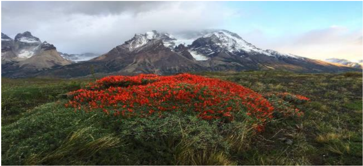
Cuanaco bushes in Torres del Paine National Park

We'll travel to Torres del Paine National Park, where Pumas are often seen at close range and are fearless due to the lack of hunting and persecution! Imagine observing them stalk their prey amid glistening glaciers, turquoise lakes, and hillsides ablaze with scarlet, orange, and yellow wildflowers. We will also enjoy herds of wild Guanaco, flocks of Lesser Rhea, and majestic Andean Condors and Magellanic Woodpeckers.