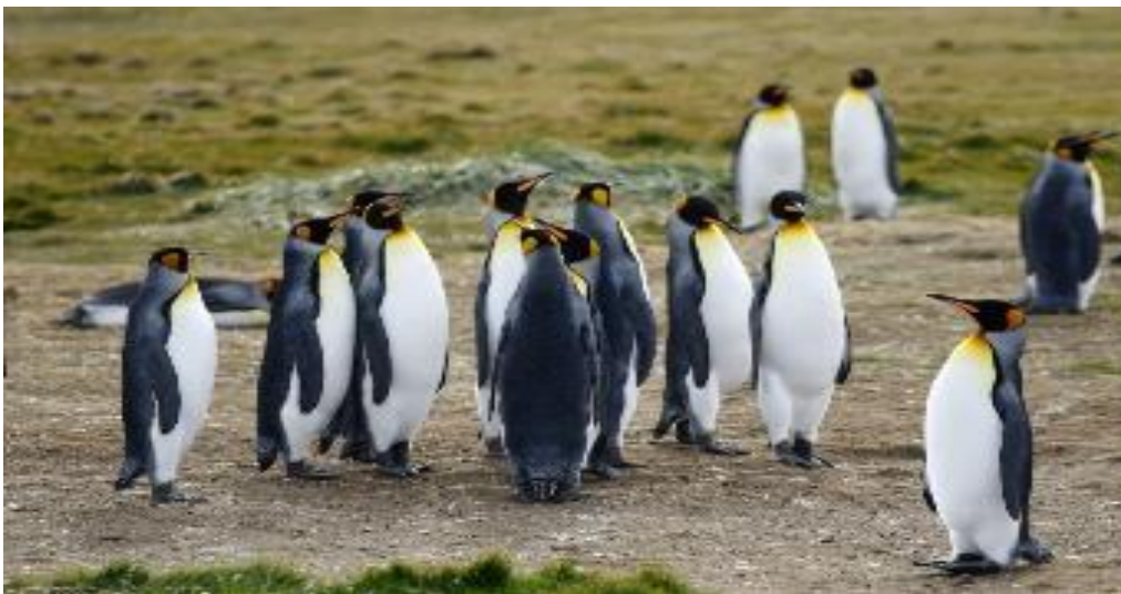
Another trip highlight is the spectacular King Penguin colony on Tierra del Fuego

A good dirt and asphalt road takes us across the remote landscape to Bahía Inútil and a close encounter with a thriving colony of King Penguins; there are more than 130 birds in this