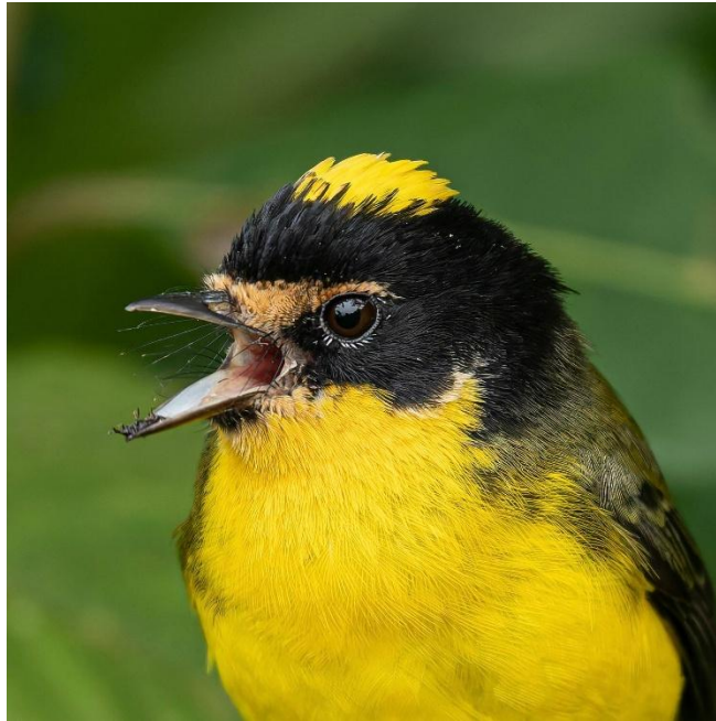
Yellow-crowned Redstart.