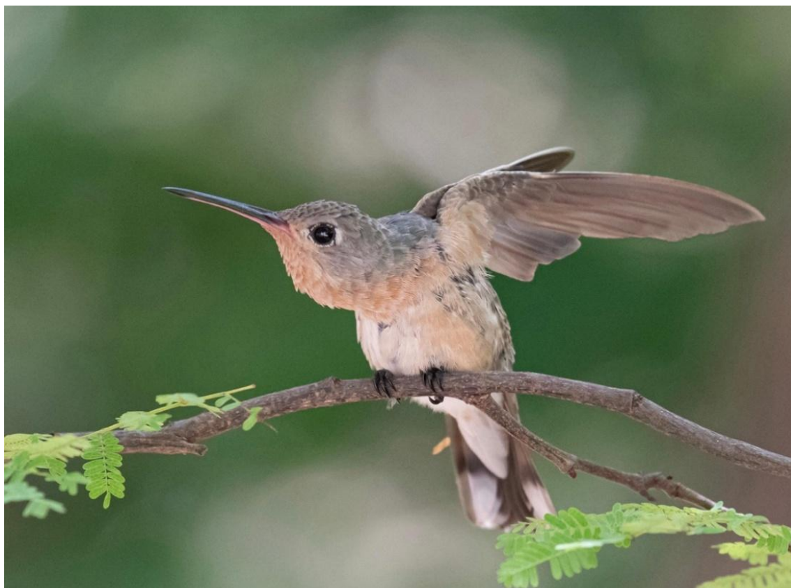
Buffy Hummingbird

NIGHT: Tayrona National Park, Magdalena department