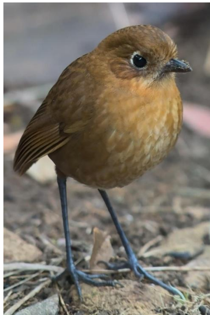
Sierra Nevada Antpitta.

The narrow road leading up onto the Cuchillo (knife) de San Lorenzo, and the site of our lodge, is reasonably good at first, but road conditions steadily decline, and eventually you will see why we summoned such rugged vehicles—and why we have to drive at low speed. But, the views from the lodge and the birdlife on this mountaintop ridge more than compensate. This is, in fact, the crown jewel of the trip, the largest mother lode of endemics, and some of the most inspiring scenery of the trip. At dusk, with the calm Caribbean spread out far below, the lights of ships visible at sea, and the long, narrow isthmus of land stretching far westward toward the distant glow of