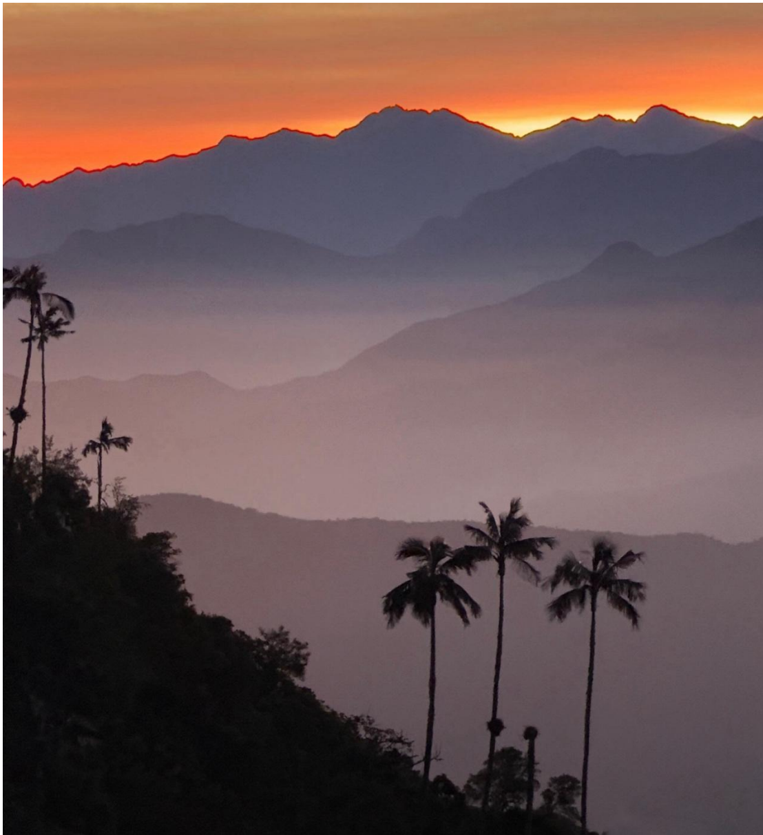
Santa Marta Mountains.

For years birders and naturalists have looked longingly at Colombia's enormous list of birds—the longest in the world—and of its enticing endemics—some 80+ species found only within its borders. One of the most endemic-rich sites of all is, ironically, one of the closest for travelers—the Santa Marta Mountains. These lofty, pyramid-shaped mountains spring up from the shores of the Caribbean to nearly twenty thousand feet and they are a birder's dream. More than twenty five species of endemic birds, gorgeous scenery and a new and comfortable mountain lodge are situated in a perfect climate zone. It's an ideal ten-days get-a-way and, to top it off,