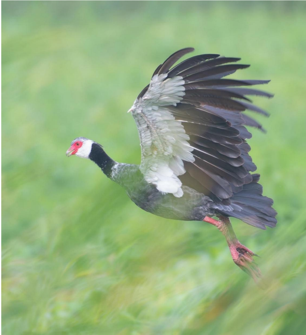
Northern Screamer.