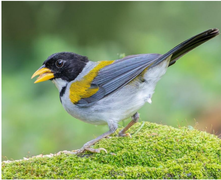
Golden-winged Sparrow.

We will arrive to Tayrona National Park for lunch followed by a break and an afternoon exploration to the surroundings of the hotel. Some of the species we may find include Russet throated Puffbird, Rufous tailed Jacamar, Scaled Dove , Golden-winged Sparrow, Olive gray Saltator and Orange crowned Oriole.