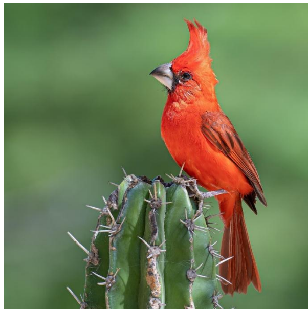
Vermilion Cardinal.