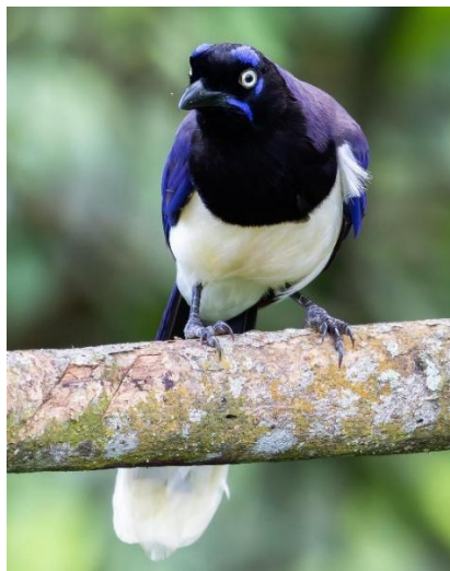
Black-chested Jay.

We will spend our morning hours in the low, desert scrub vegetation—indeed among the driest anywhere in Colombia—near the town of Riohacha. We will look for some of the true “arid habitat” specialties of the Caribbean coast, among them such striking species as White-whiskered Spinetail (one of the prettiest spinetails on the continent) and the lovely Vermilion Cardinal with its super-long pointed crest. A sampling of desert scrub species here includes: Harris’s Hawk; Common Black-Hawk; Pearl Kite; Aplomado Falcon; American Kestrel; Ferruginous Pygmy-Owl (not as numerous here as it ought to be); Bare-eyed Pigeon (quite numerous); Common and Ruddy ground-dove; Brown-throated and Blue-crowned parakeet; Green-rumped Parrotlet; Burrowing Owl; Red-billed Emerald; Buffy Hummingbird; Rufous-tailed Jacamar; Russet-throated Puffbird; Chestnut Piculet (a bit scarce and always a favorite); Red-crowned Woodpecker; Straight-billed Woodcreeper (pale headed population); Caribbean Hornero; Pale-breasted Spinetail; Black-crested and Black-backed antshrikes; Northern White-fringed Antwren; Northern Scrub-Flycatcher; Southern Beardless-Tyrannulet; Slender-billed Tyrannulet; Pale-eyed Pygmy-Tyrant; Pearly-vented Tody-Tyrant;