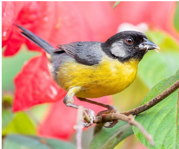
Santa Marta Brushfinch.