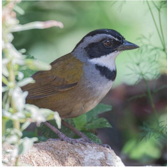
Sierra Nevada Brushfinch.