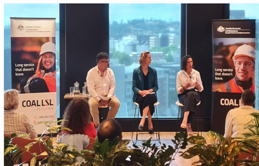
Outside the bubble – how regional agencies interact with head office (November 24)