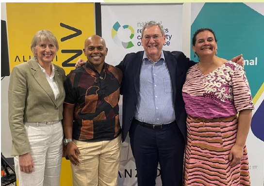
Meet the regulators – Supporting First Nations Australians to build strong, equitable and sustainable communities

about the structural power imbalances embedded in 'business as usual' systems, and the responsibility regulators carry to actively address them. Speakers drew attention to the concrete steps available right now. Cultivating trust and cultural respect as genuine organisational capability, including through commitments such as a Reconciliation Action Plan; being transparent about legislative remit and its constraints; and applying proportionate, risk-based approaches that lead with support and self-remedy, while remaining willing to take decisive action where governance failures undermine member confidence or public accountability.