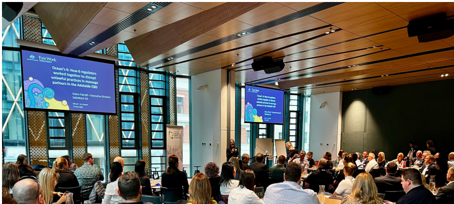
Ocean’s 6: how six regulators worked together to disrupt unlawful practices in massage parlours (May 25)

Community engagement continues to be a key strength of the South Australian chapter. Event attendance remains consistently high, with members actively contributing by asking insightful questions and creating a welcoming and collaborative environment.