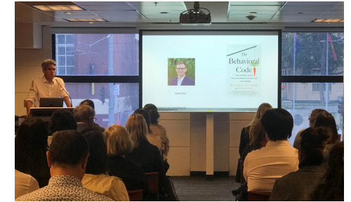
Motivating people to follow rules: how can good regulation lead to better regulatory outcomes (September 25)