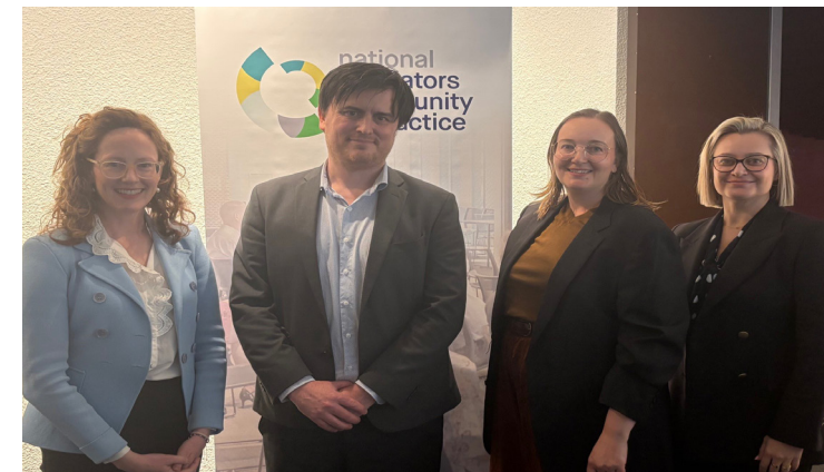
Permissions: practice and reform (November 25)

"I really appreciated the candid nature of the discussion - and the feeling of a safe space to share and learn. Great that they shared successes and failures - very relatable and authentic".