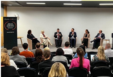
Regulating: cyber security, risks, and harms (November 25)

"This was a great example of an engaging webinar - really knowledgeable people and relaxed discussion".