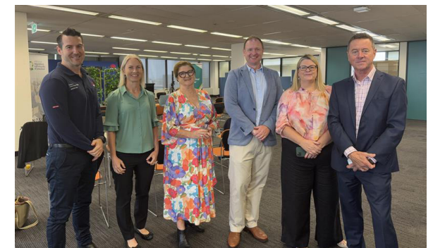
NSW – Panel discussion: administrative decision making by regulators (August 24)