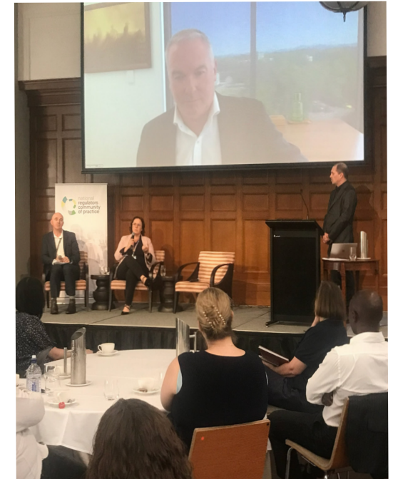
Managing change in regulators – the how and the why (October 25)

“I found the session refreshing and a nice change of pace. It was great to hear from others in regulation and validate we are all working in similar environments regardless of which sector/what we regulate”.