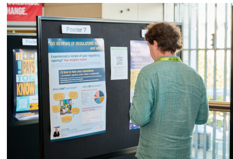
Poster Display (2025 Conference)