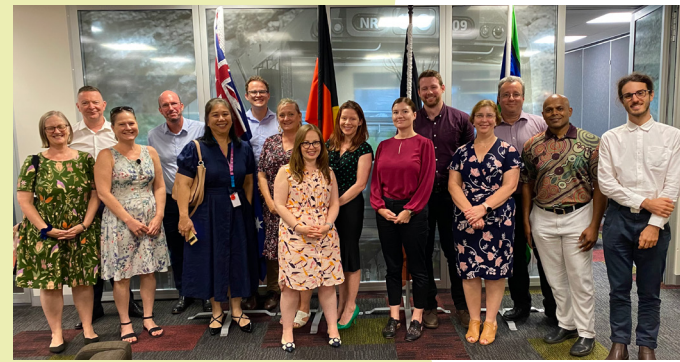
Financial wellbeing, resilience and protecting vulnerable consumers (March 24)