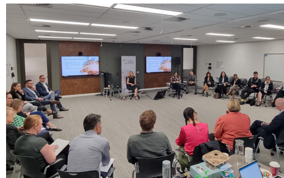
WA – Chapter Workshop (September 24)