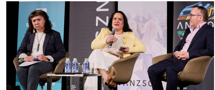
Plenary Session: First Nations voices – in, out and around regulatory practice

NRCoP will continue to create spaces where regulators can learn from First Nations voices and from one another, deepening the practical capability needed to embed self-determination in regulatory design, engagement and decision-making. This sustained focus is how commitments become consistent practice, and how regulatory systems can ultimately contribute to stronger, more equitable outcomes for First Nations communities.