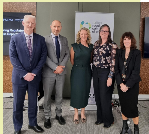
The Hidden Signals: Enhancing Regulatory Oversight through Near-Miss Reporting (September 24)

“Great to meet new people and think about the issues from different angles. I liked the commentary on public trust and complexity”.