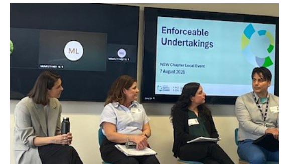
Enforceable undertakings (August 25)