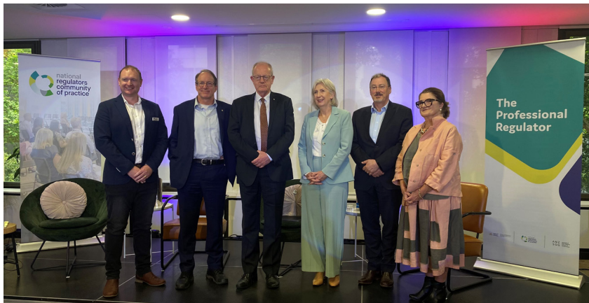
Australia's integrity landscape – learning from the past and preparing for the future (October 24)