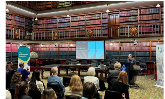
Regulation and Parliament (November 24)