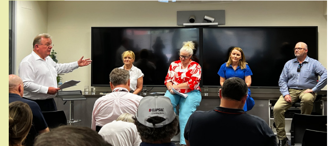
Rules, regulations and assistance: what's changed and how regulators can help (October 25)