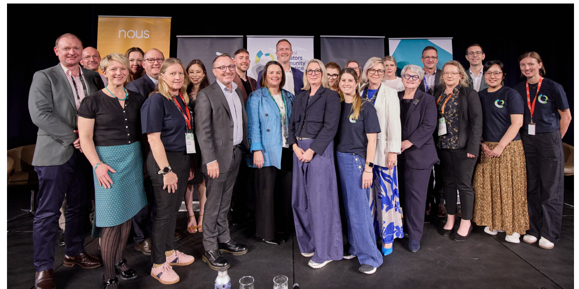
NRCoP Steering Committee, Chapter Chairs & NRCoP Team (2025 Conference)

“NRCoP team continues to lead the pack in terms of collaboration, support and building a strong regulator network. Love your work.”