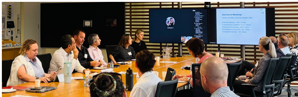
AI workshop #2 – implementing AI into your regulatory operations (November 25)

With a dedicated and forward-looking committee, the Queensland Chapter is focused on creating inclusive opportunities for all members, with a particular emphasis on supporting early-career regulators. The Chapter looks forward to continuing to deliver high-quality local and national events for the Queensland community.