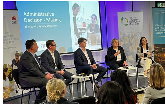
Administrative decision making by regulators (August 24)

"It is so enlightening to hear about the different perspectives and makes for more effective collaboration when you understand the impediments, or challenges that other parties face".