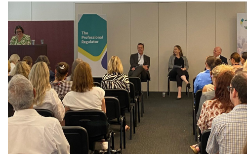
Investigations (September 25)