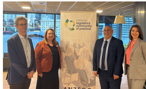
Beyond the pyramid: developing compliance and enforcement policies that break the mould (July 25)

"Really great event. This was the first one I have been to, but I will be recommending to others in my network as I thought it was extremely well run and very interesting".