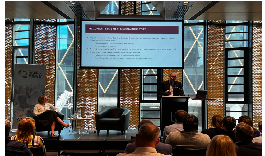
The regulatory state: faults, flaws, and false assumptions (April 25)

“One of the best sessions I've attended. Always great, but this was very engaging. Different presenters covering taskforce aspects was fantastic.”