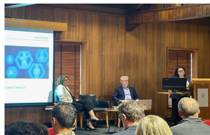
The Politically Astute Regulator (November 25)

“Great to meet new people and think about the issues from different angles. I liked the commentary on public trust and complexity”.