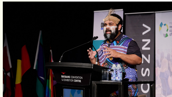
Welcome to Country speaker from Tribal Experiences

"I really appreciated the Welcome to Country; it set a meaningful and respectful tone. Thank you, and please pass on my gratitude to the Elder who delivered the Welcome to Country".