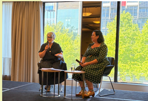
International trends and developments in regulation: OECD takeaways (December 25)