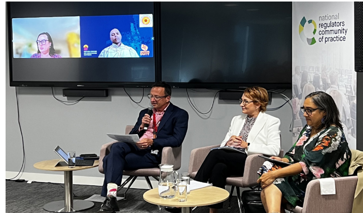
Why diversity, equity and inclusion matters and the important role we play as regulators (February 25)

The chapter also undertook an expression of interest process to welcome new members, attracting strong interest from across the sector. With an expanded and energised committee, the Victorian Chapter is well positioned for 2026, bringing fresh ideas, perspectives, and connections to its growing network.