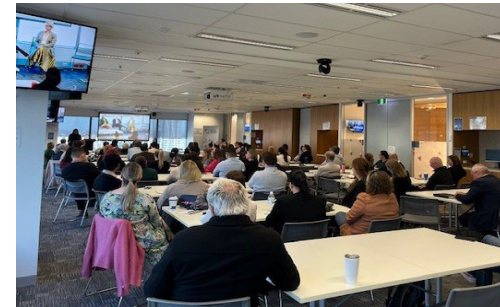
Day one: what we wish we'd known (July 25)