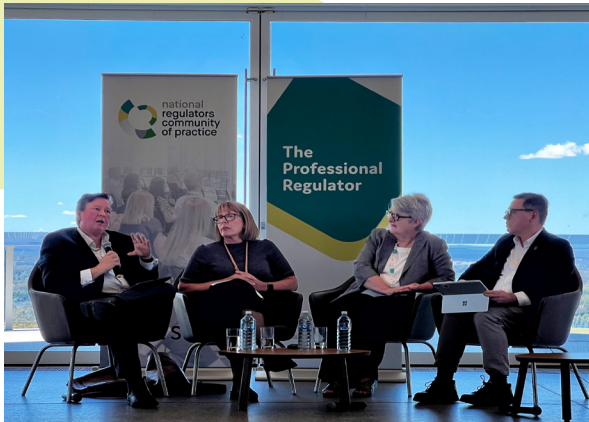
Better ways to assess regulatory impact: RegValue 1.0 (December 24)

These sessions created valuable opportunities for members to engage with emerging challenges, exchange perspectives, and reflect on how global developments are influencing local regulatory practice. The Chapter continues to benefit from an active and engaged community, with members consistently contributing to thoughtful discussion and shared learning.