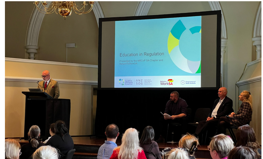
Education as a regulation tool (September 24)