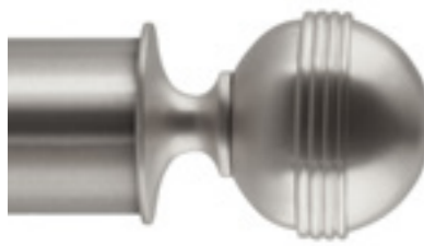
FOUR RIB BALL FINIAL

Code Size (mm) Size (inches) RE25 50 x 65 2 x 2.1/2