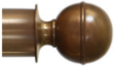
ONE RIB BALL FINIAL

Code Size (mm) Size (inches) RF25 40 x 50 1.1/2 x 2