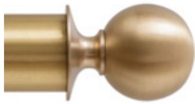
PLAIN BALL FINIAL

Code Size (mm) Size (inches) BF25 40 x 50 1.1/2 x 2