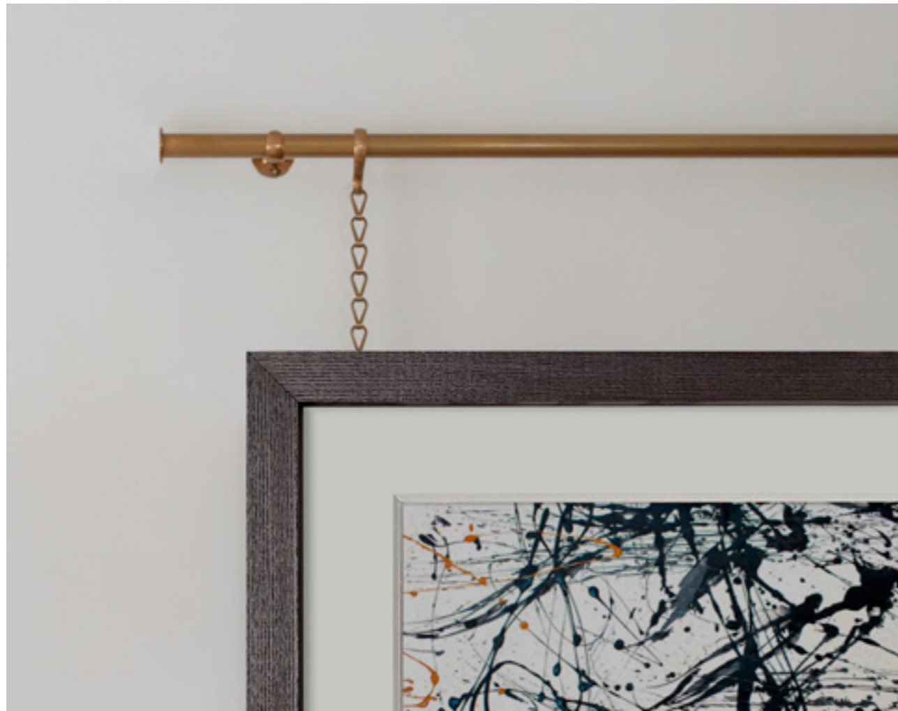
Below: Picture Hanging Rail in Antique Brass.