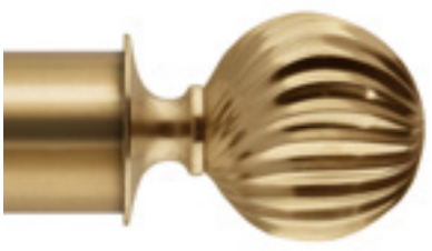
TWISTED BALL FINIAL

Code Size (mm) Size (inches) TD25 45 x 65 1.3/4 x 2.1/2