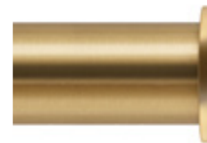
DISC END CAP FINIAL

Code Size (mm) Size (inches) EC25 35 x 4 1.3/8 x 5/32