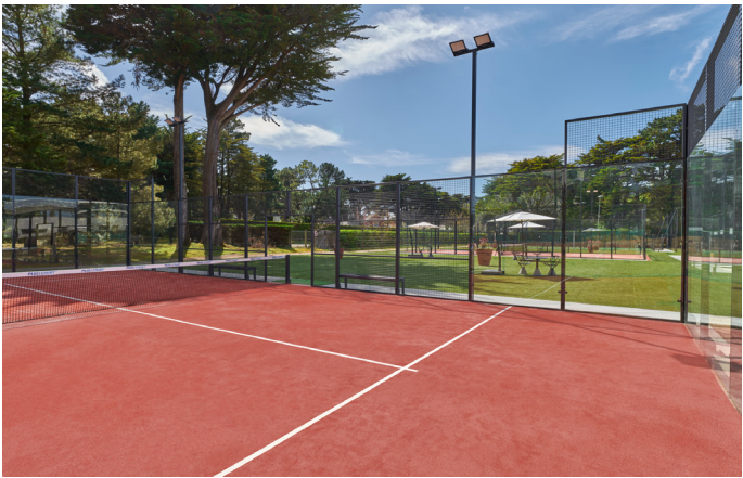
PADEL LA BAULE