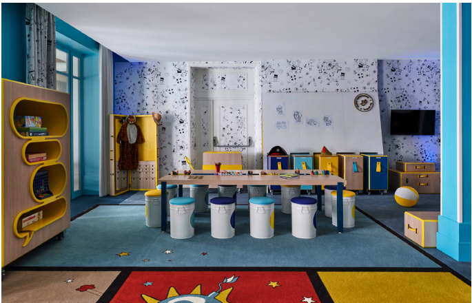
KIDS CLUB HERMITAGE