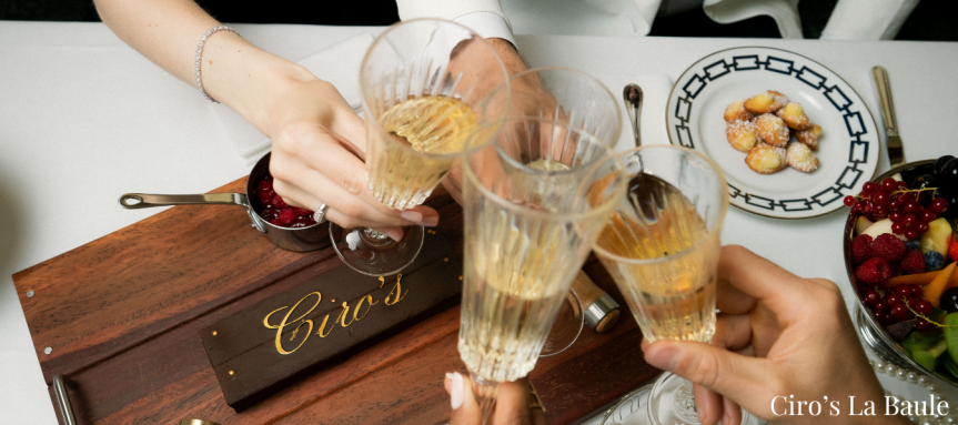
Ciro's La Baule