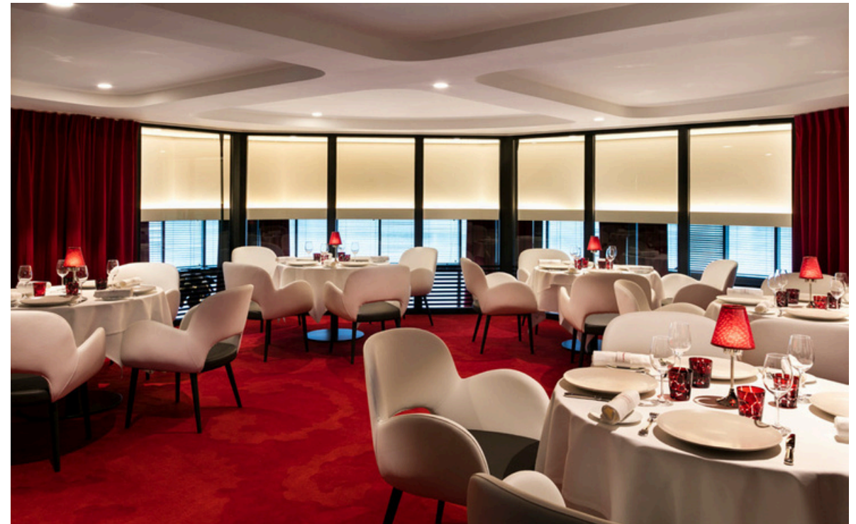
PAVILLON DU LAC LOUNGE