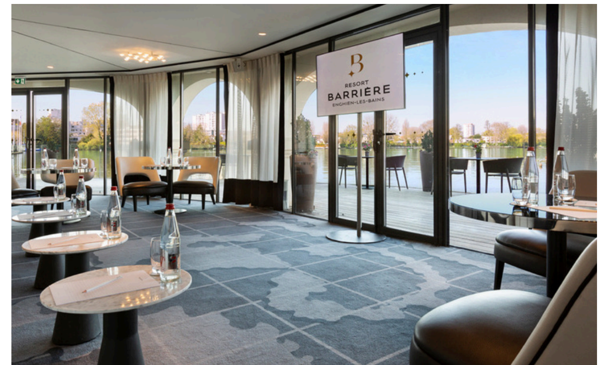
PAVILLON DU LAC BAR