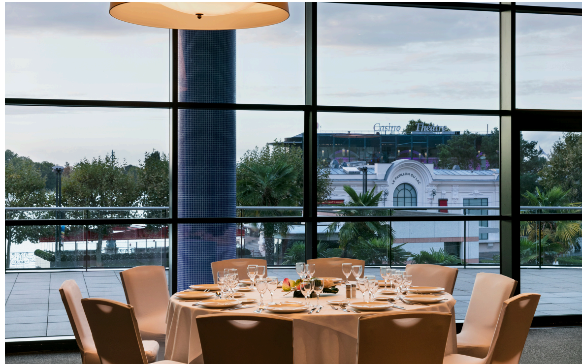
THE NOVA PERGOLAS