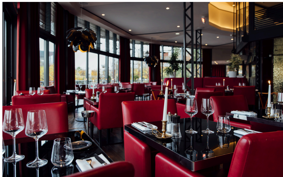
THE PAVILLON DU LAC