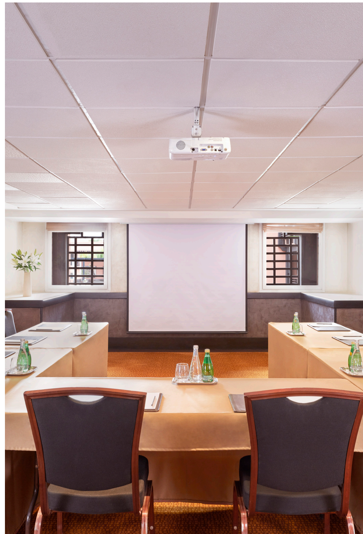
LA BAULE RECEPTION ROOM, LE NAOURA HOTEL