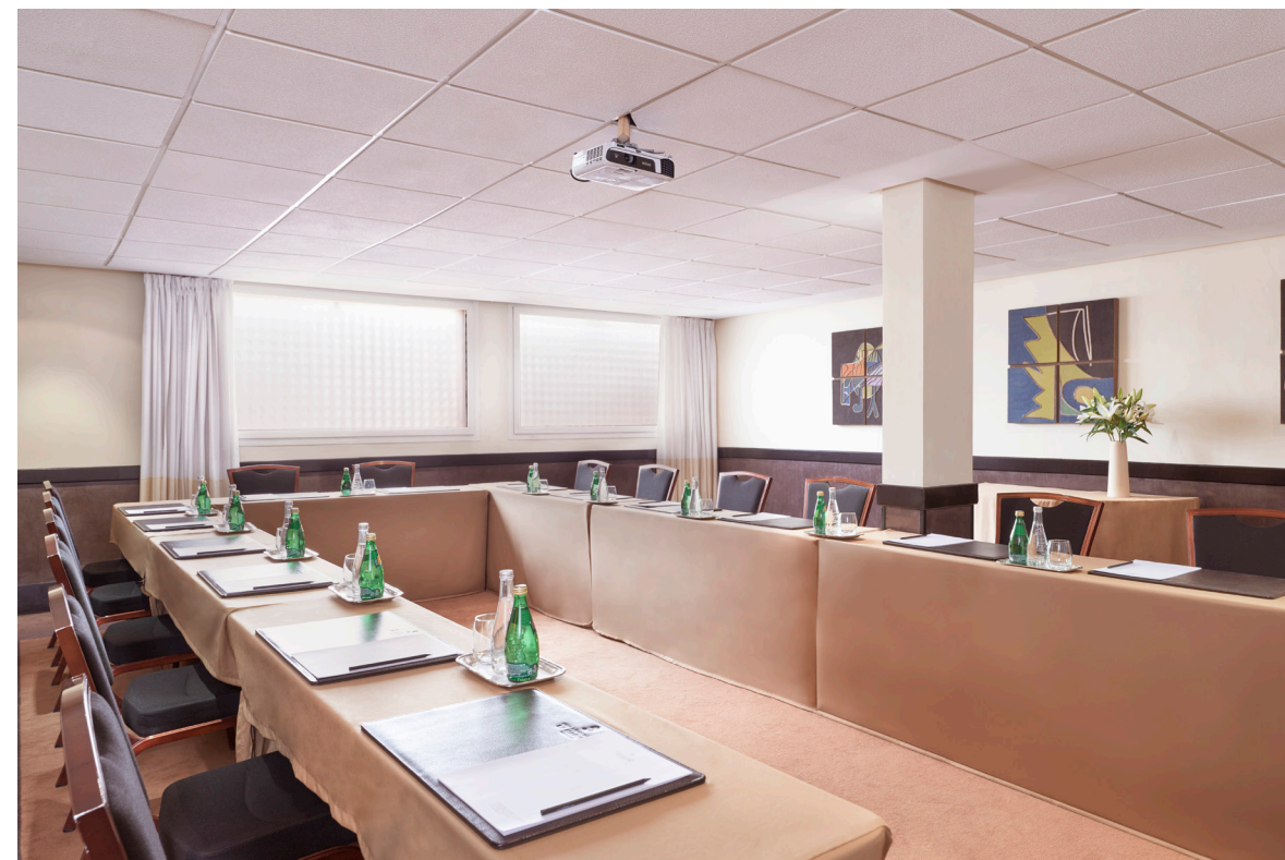
DEAUVILLE MICE ROOM, LE NAOURA HOTEL