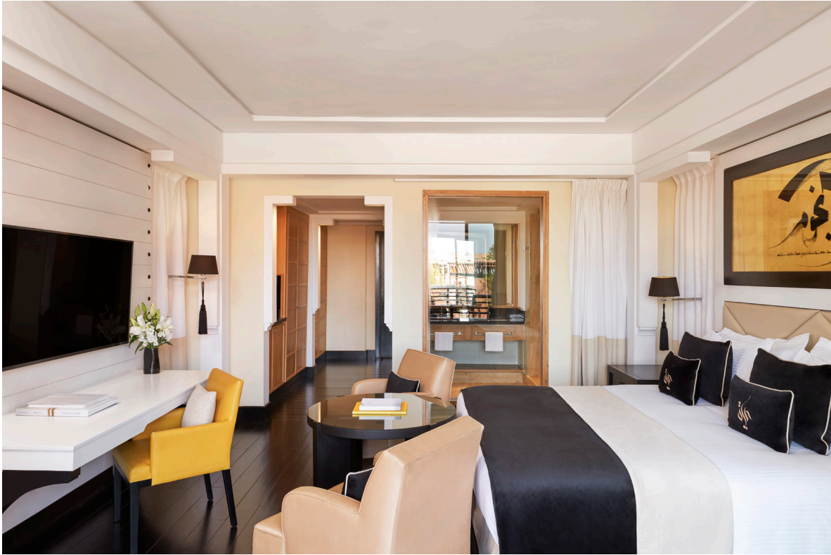
DELUXE ROOM - LE NAOURA