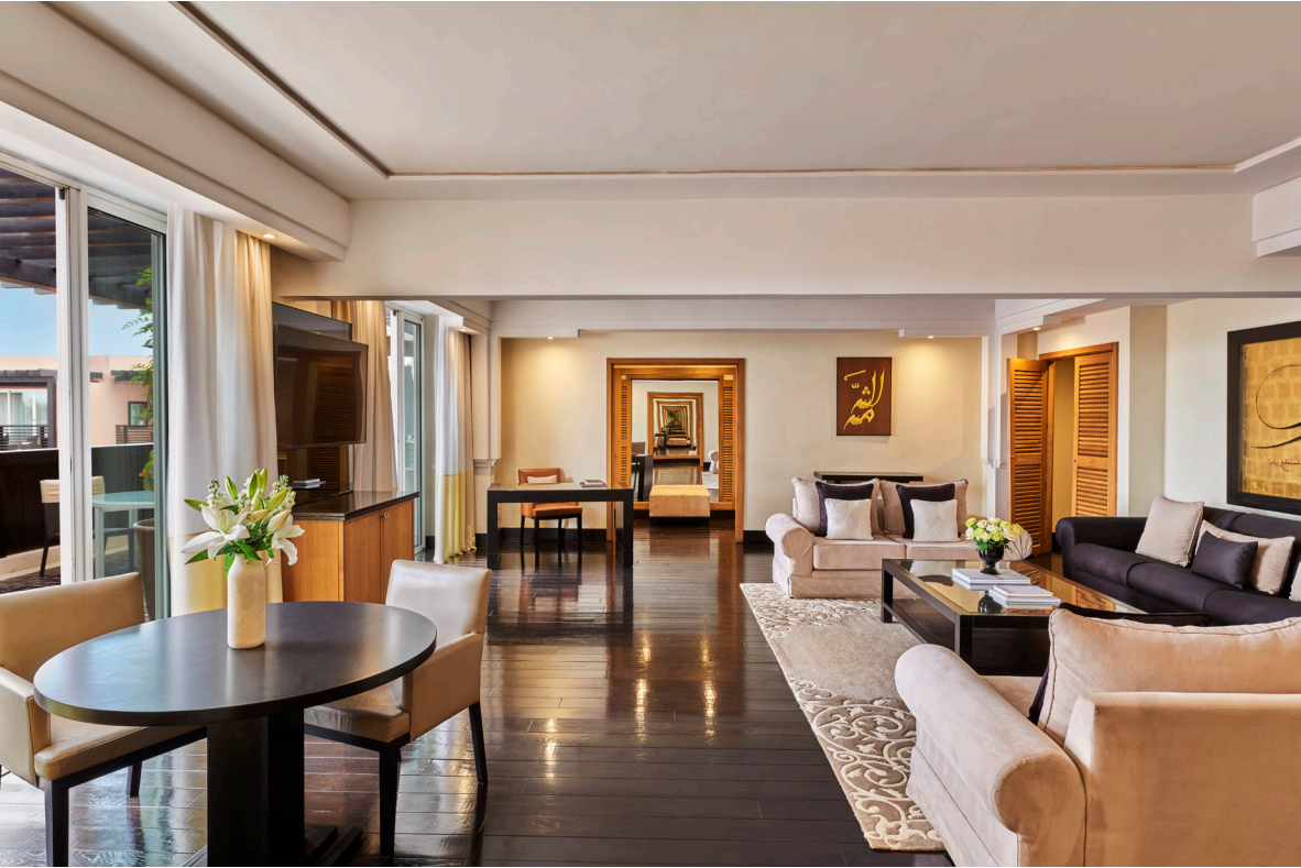
ROYAL SUITE - LE NAOURA

40 Superior and Deluxe rooms, 38 Deluxe Junior Suites, 4 Suites, 2 Riad suites, and 13 Riads