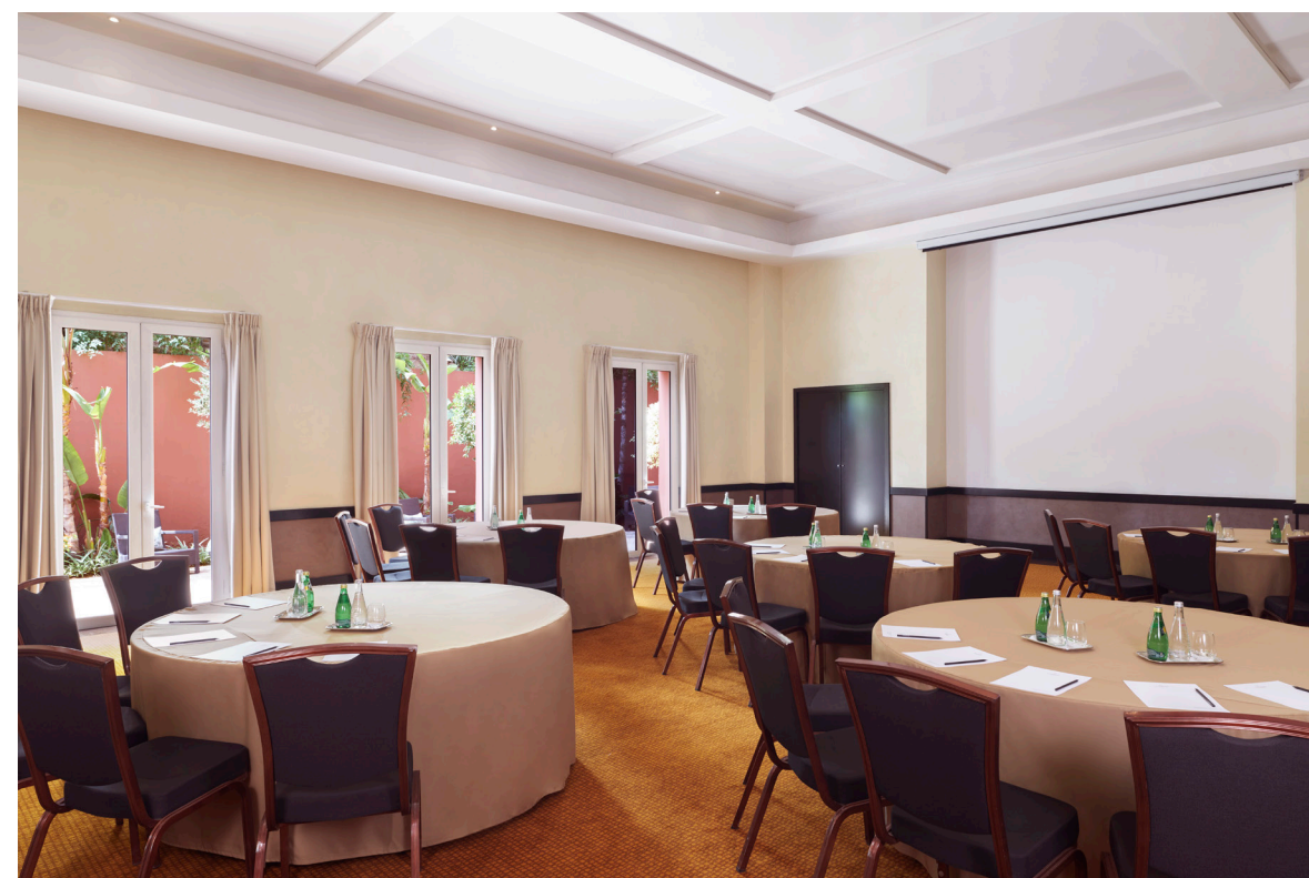
PARIS RECEPTION ROOM, LE NAOURA HOTEL