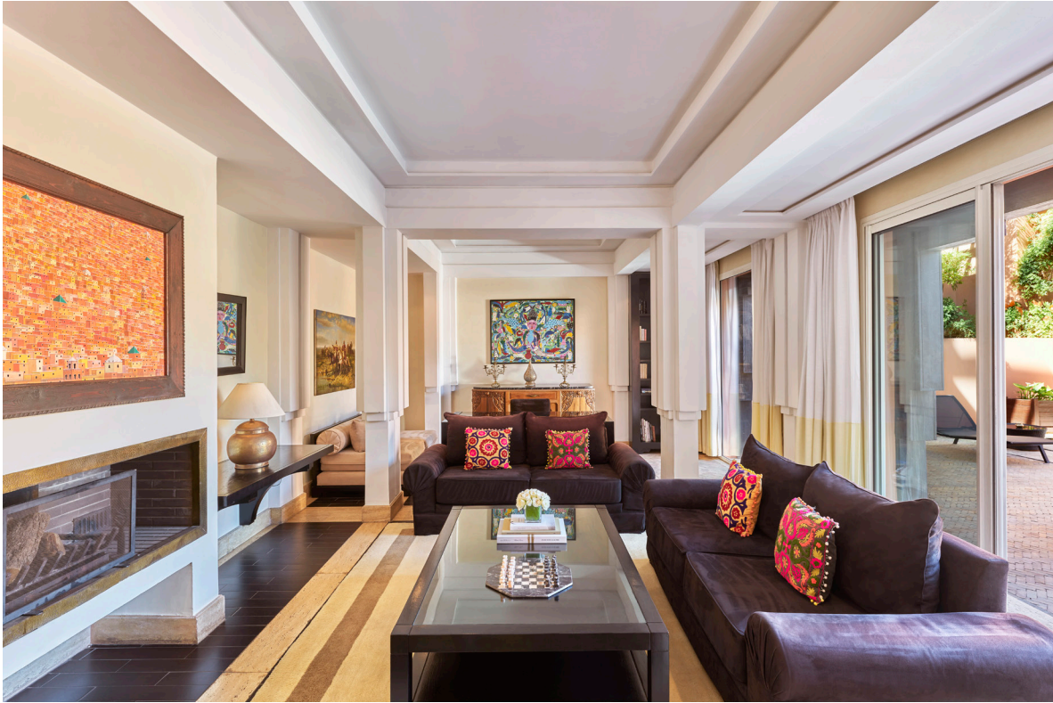
RIAD - LE NAOURA