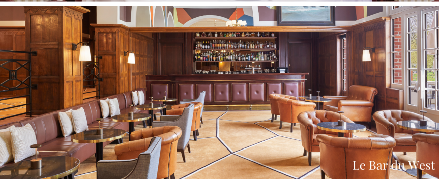
Le Bar du West