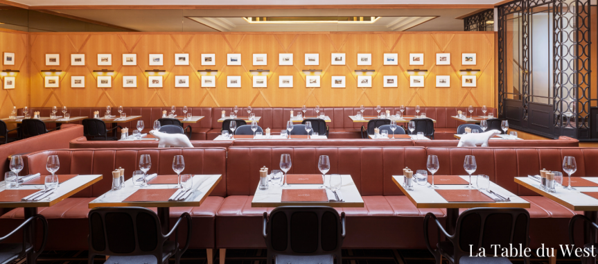
La Table du West