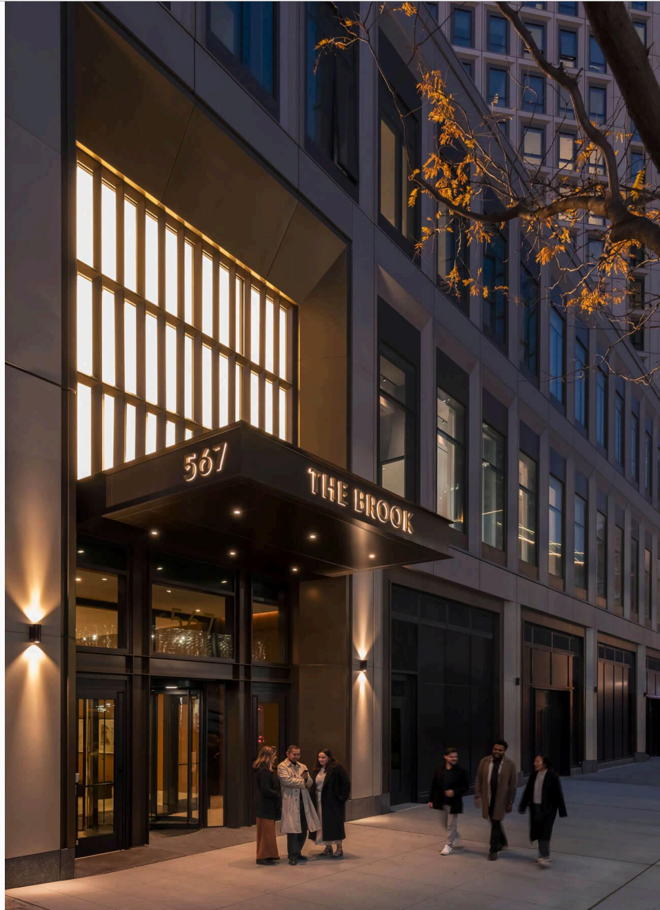
The main entry is on Fulton Street.

A new high-rise by Beyer Blinder Belle, with an interior lobby by Bonetti/Kozerski, opens its doors in downtown Brooklyn