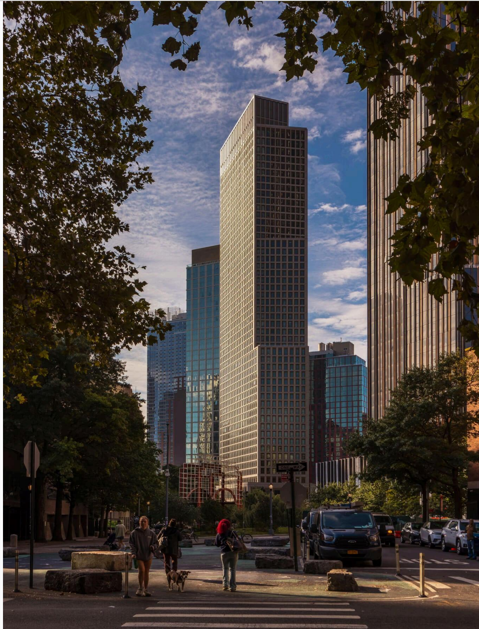
The Brook is sited above Albee Square.

The Brook has 591 units, 30 percent of which are designated affordable. A 25,000-square-foot retail space is located at grade; Taiwanese restaurant Din Tai Fung is among the anchor tenants. Ample retail space is coupled with 30,000 square feet of residential amenities spread throughout the tower. These residential amenities include a library, outdoor pool, basketball court, landscaped terraces by MPFP , and more.