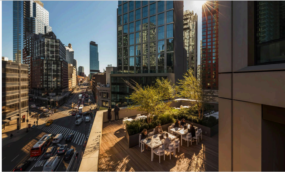
Residential amenities include an elevated terrace.