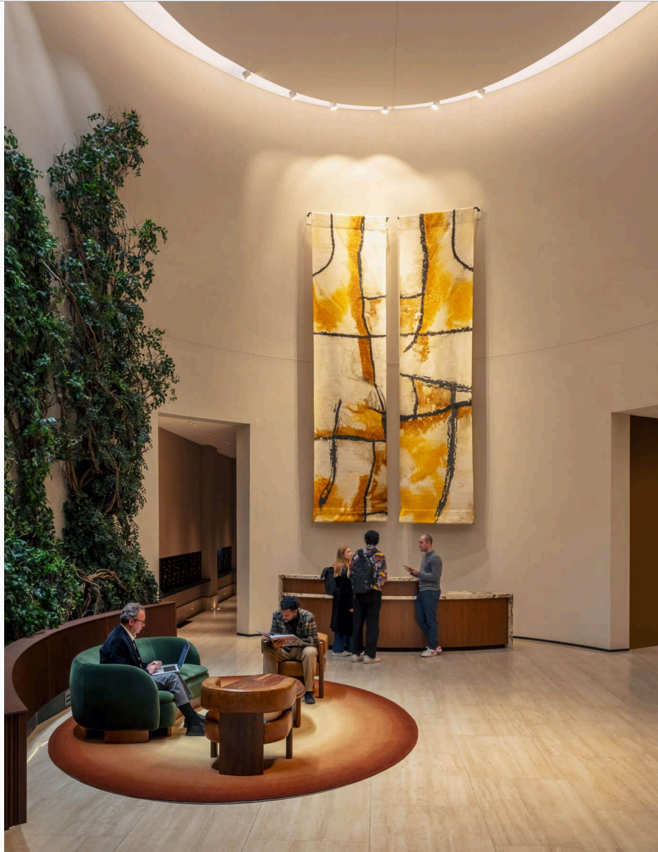
A double-height, oval atrium is connected to the Fulton Street entryway.

A new high-rise by Beyer Blinder Belle, with an interior lobby by Bonetti/Kozerski, opens its doors in downtown Brooklyn