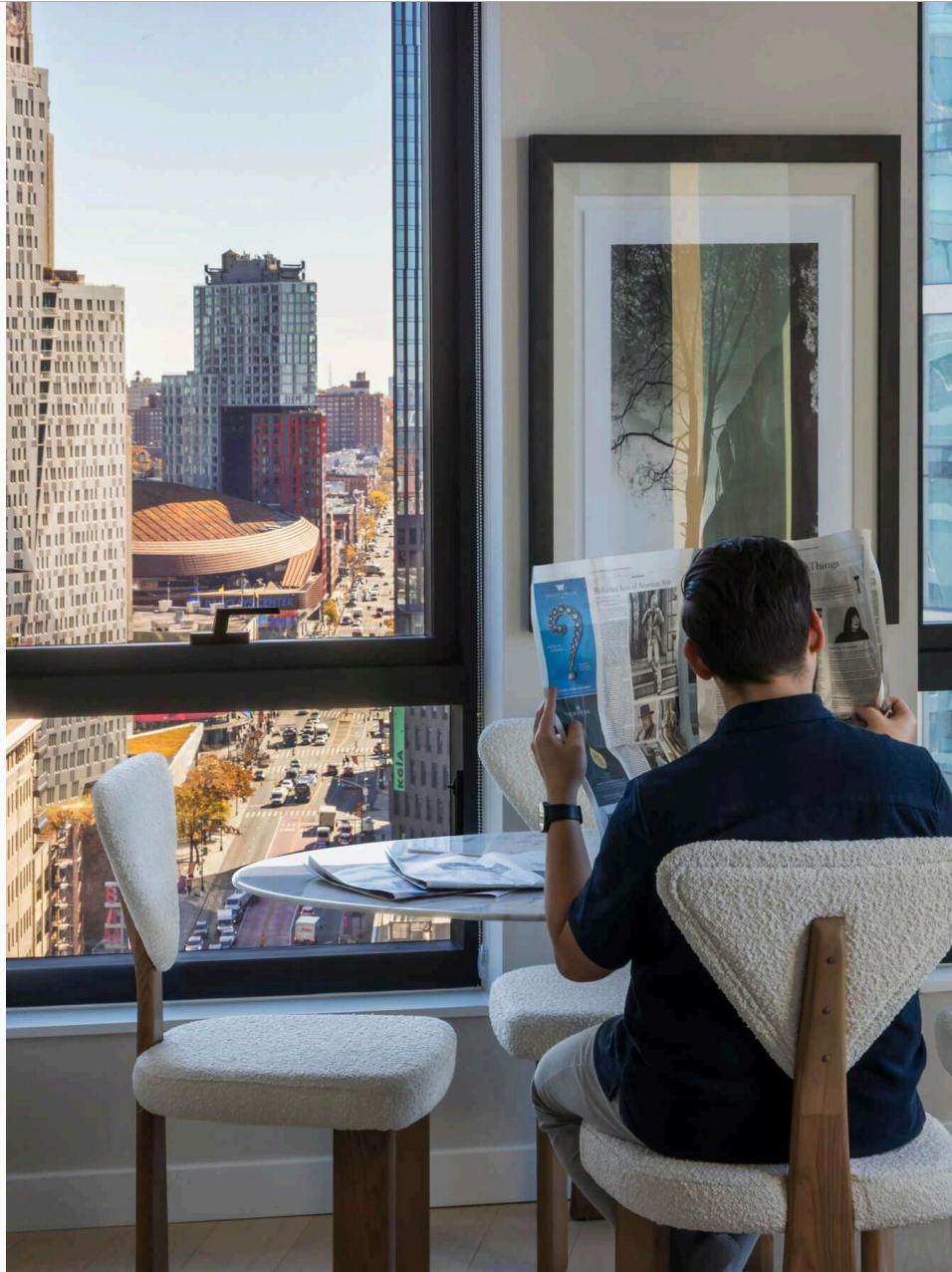
Units offer elevated views of downtown Brooklyn.

The curtainwall facade is inspired by historic Brooklyn architecture, BBB elaborated, which is meant to distinguish it from other towers in the neighborhood. Punched windows create depth and shadow lines typical in older residential buildings. The tower is clad in aluminum-composite metal panels with shades of champagne and bronze, meant to emulate nearby masonry structures.