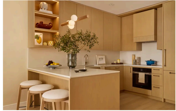
As of publication, The Willow was over 65 percent sold and move-ins are expected to begin in the spring