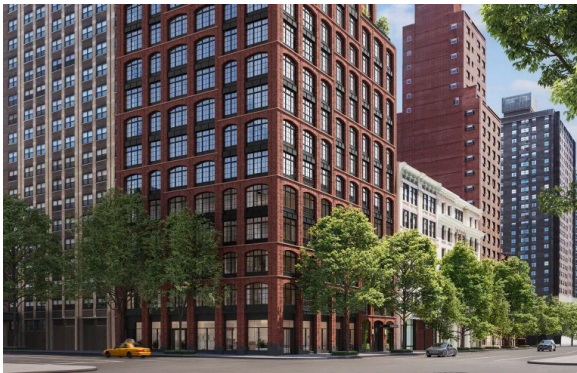
The exterior of 201 East 23rd St was done by Cookfox Architects.