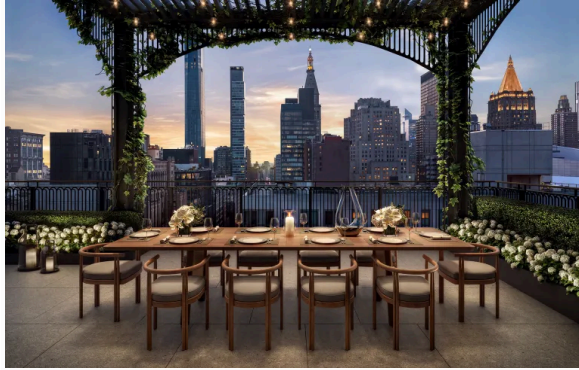
Willow residents will have access to a rooftop dining and lounge space.