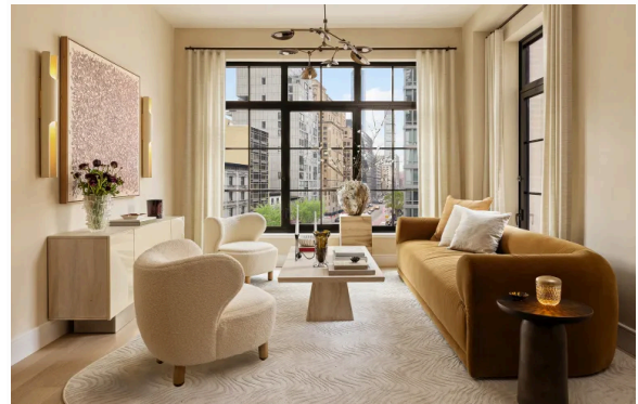
The units range from one to four bedrooms, with one-bedroom homes starting at $1.2 Million.