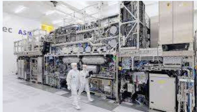
ASML's Next-generation High NA (high numerical aperture) EUV lithography systems