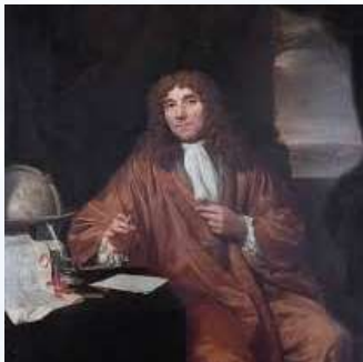
Antoni van Leeuwenhoek - Microscope