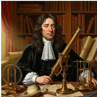
Christiaan Huygens - Telescope