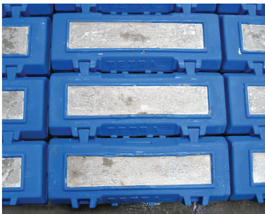
DE NORA TETRA SNAP T Block