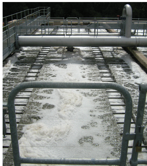
DE NORA TETRA NSAF+