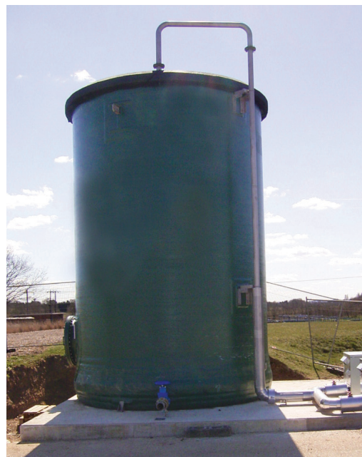
DE NORA TETRA NSAF

The design is particularly well suited to large plants, where savings in electricity costs can have a major impact on budgets.