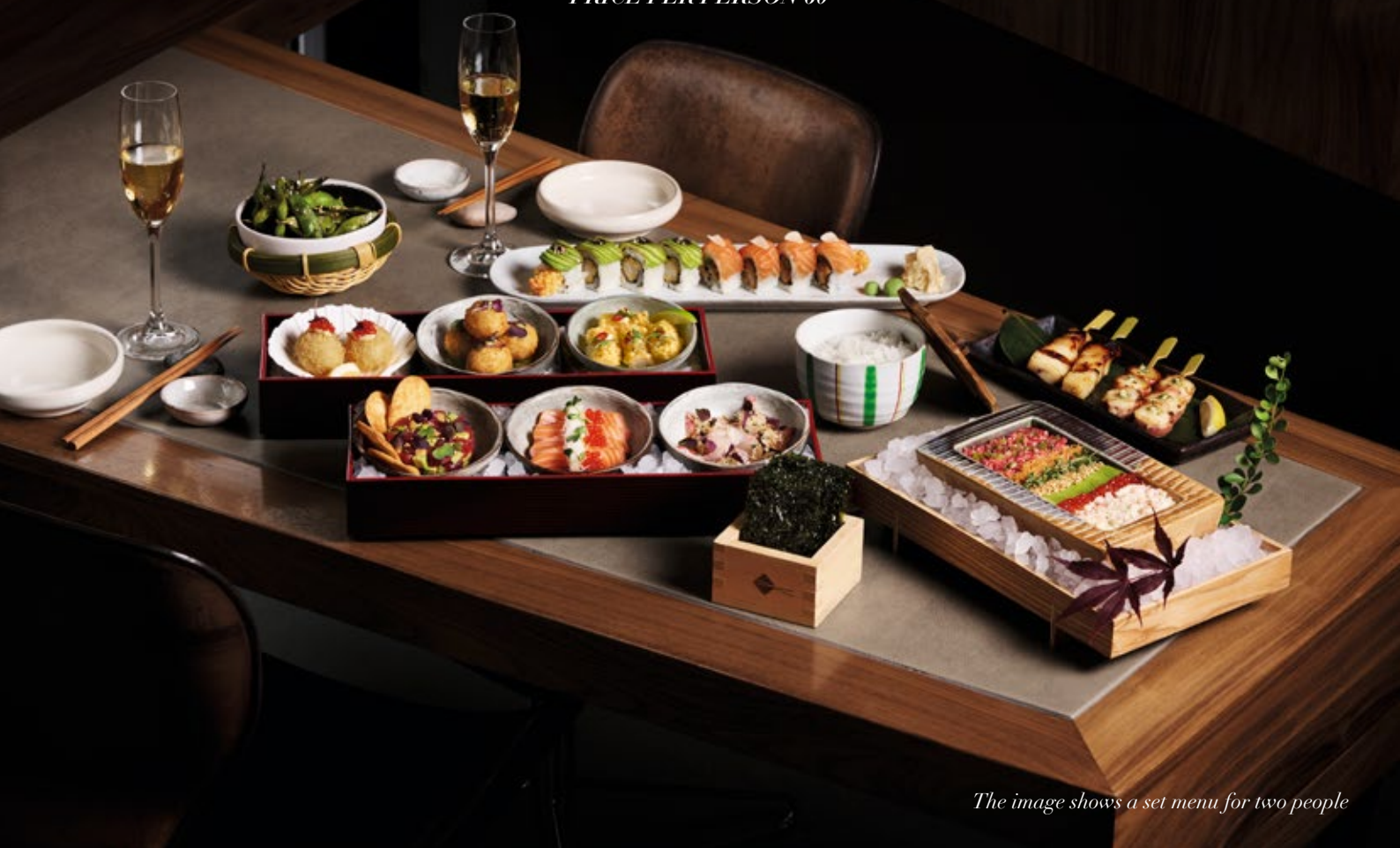
The image shows a set menu for two people