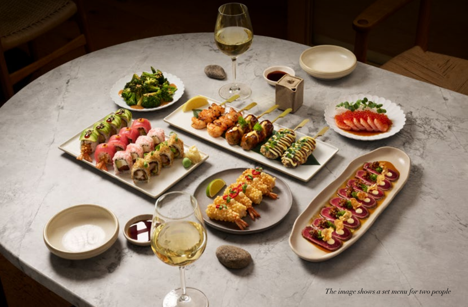
The image shows a set menu for two people