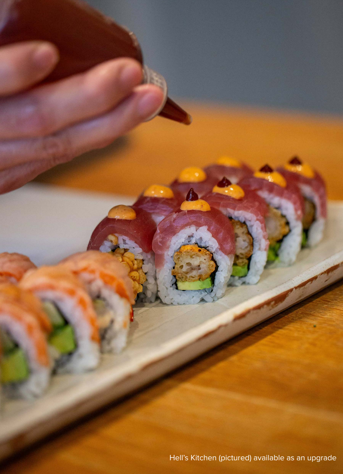
Hell's Kitchen (pictured) available as an upgrade