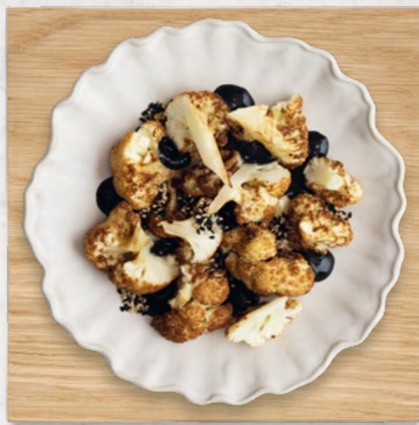
CAULIFLOWER Fried and served with black truffle goma. Kr. 62