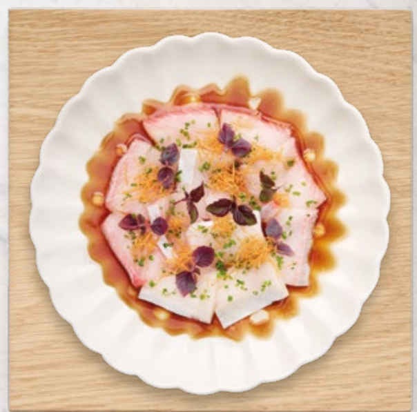
HIRAMASA KATAIFI Hiramasa, kataifi, chives, shiso, truffle oil & ponzu. Kr. 129