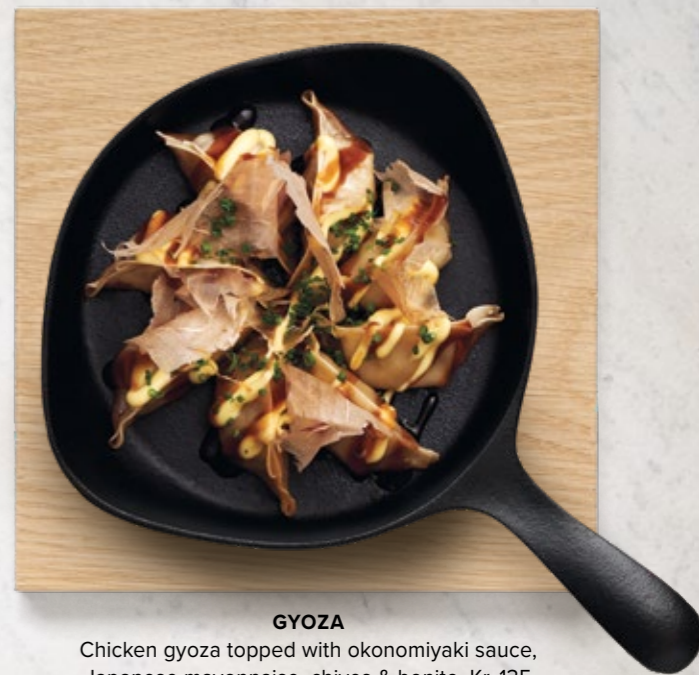
GYOZA Chicken gyoza topped with okonomiyaki sauce, Japanese mayonnaise, chives & bonito. Kr. 135