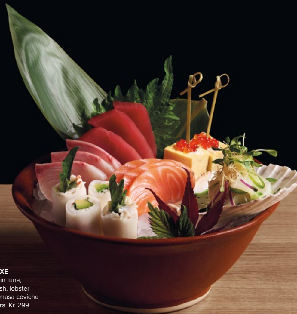
SASHIMI DELUXE Salmon, yellowfin tuna, yellowtail kingfish, lobster daikon roll, hiramasa ceviche and tamago ikura. Kr. 299