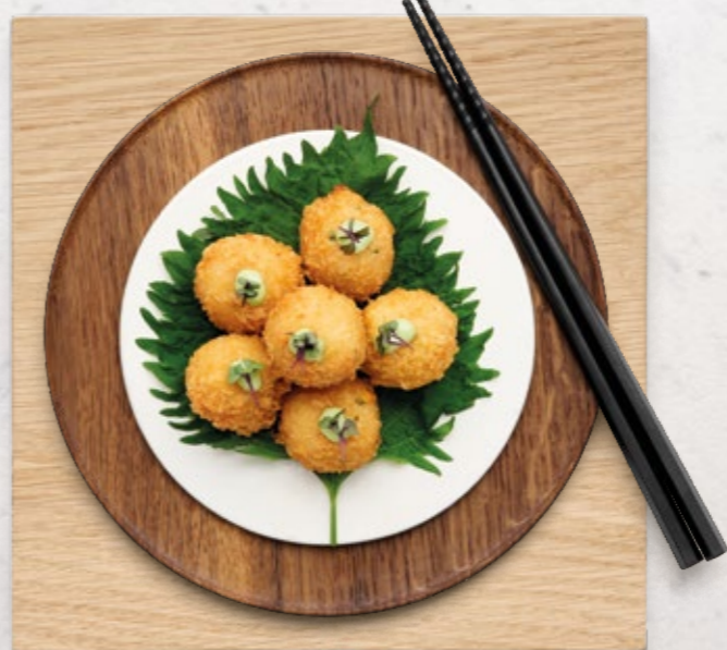
KANI KOROKKE Crab croquettes with wasabi Caesar. Kr. 99