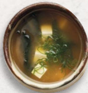
MISO SOUP Miso with tofu, spring onion & wakame. Kr. 25