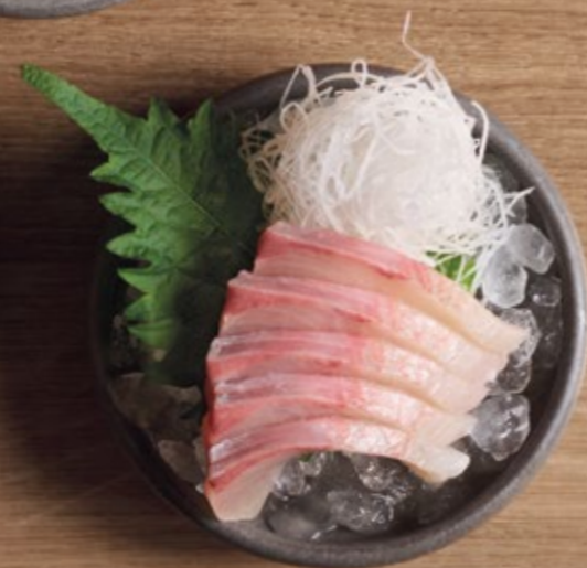
HIRAMASA Yellowtail kingfish. Kr. 119