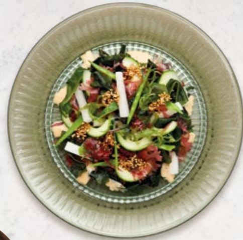
SEAWEED SALAD Seaweed, daikon, snow peas, cucumber & sesame dressing. Kr. 52