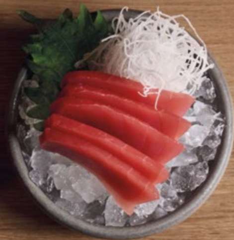
MAGURO Yellowfin tuna. Kr. 109