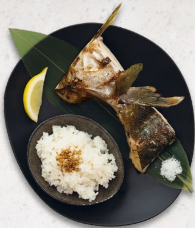
HIRAMASA KAMA Hiramasa collar with sea salt & lemon, served with miso soup and rice [Limited availability] Kr. 199