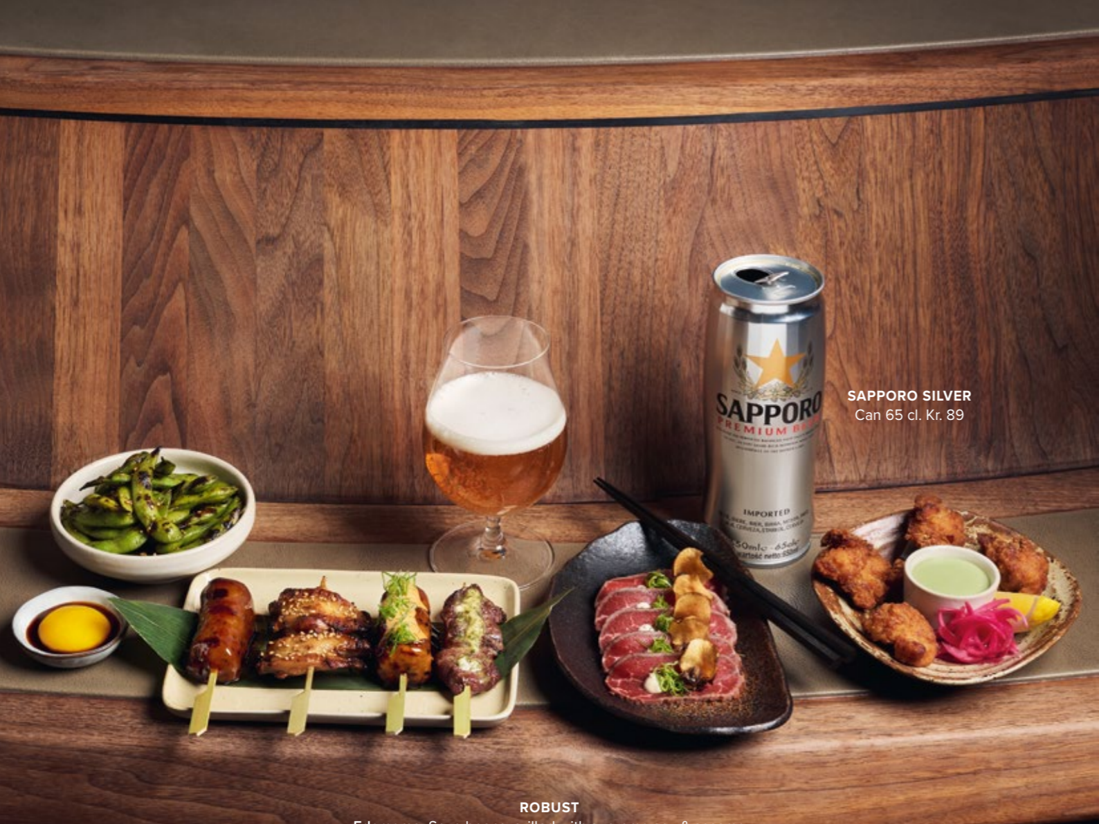
SAPPORO SILVER Can 65 cl. Kr. 89