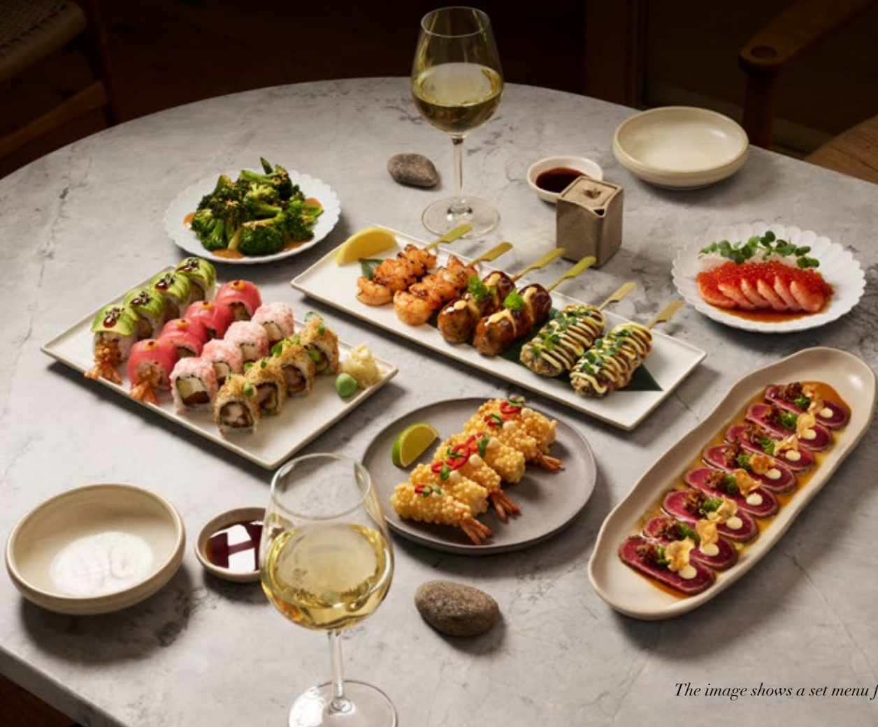
The image shows a set menu for two people