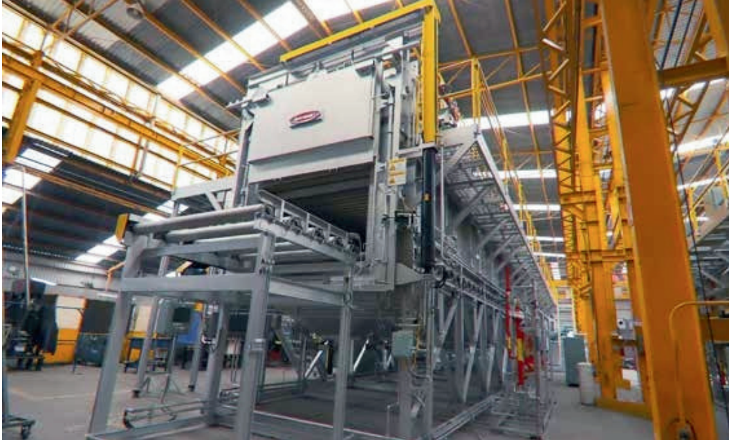
Roller hearth T6 solution and age line

Ultimate in Flexibility and Versatility for the Aluminum Industry