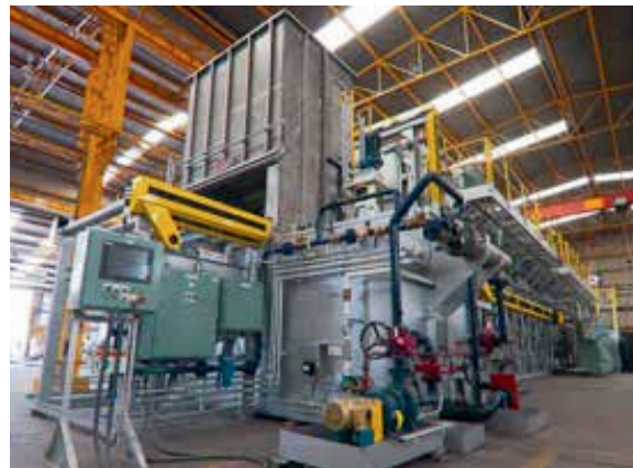
Water Quench System