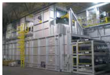
3-Tier Chain Conveyor Installation

AFC-Holcroft's experienced engineering and manufacturing staff will provide a water, polymer, or air quench system designed and manufactured with the optimum heating, cooling, recirculating system and internal ductwork that will meet customers' specifications. On a continuous solution heat treat system, AFC-Holcroft has the experience to provide a rapid transfer time from the furnace to fully submerged in the quenchant. AFC-Holcroft has the capability to provide the "time to quench" as specified by the customer.