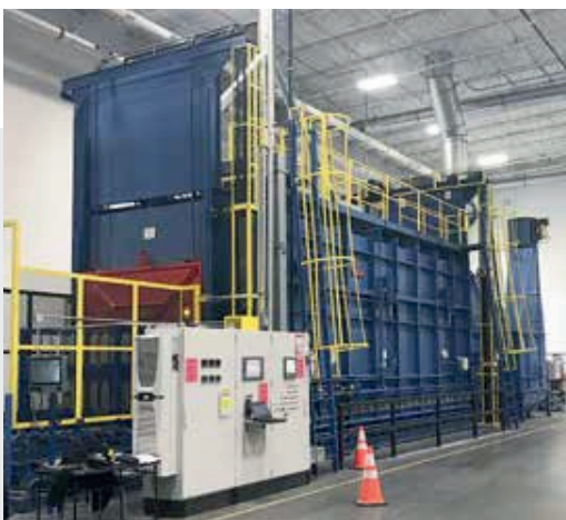
Aluminum Aging Line