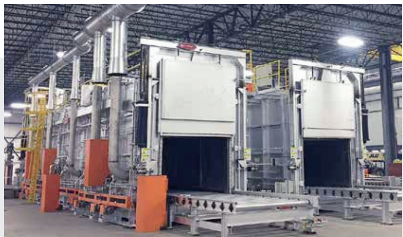
U-Shaped Configuration Solution Age Line