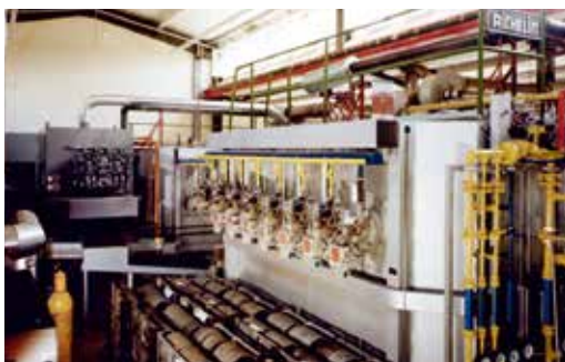
Rotary hearth furnace gas heated.

A prominent design feature of this furnace is the charging process. Charging can be performed manually, semi- or fully automatically. The entire heat treating line can be configured to run in a fully automatic – manless – production mode.