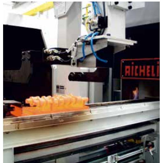
Rotary hardening of carburized TDI-camshafts with subsequent washing and tempering.

The main applications of rotary hearth furnaces are the following heat treatment processes: gas carburizing, carbonitriding as well as hardening and tempering, mainly in combination with a subsequent press-hardening process. Rotary hearth furnaces are also used for preheating before forging and for annealing. In reference to structural components rotary hearth furnaces are used in piecewise heat treatment of eg. gear parts, bearings, clutch parts, cam and hollow shafts etc. The possibility of single removal makes the rotary hearth furnaces particularly suitable for joint use with a quenching press or a hot forming machine.