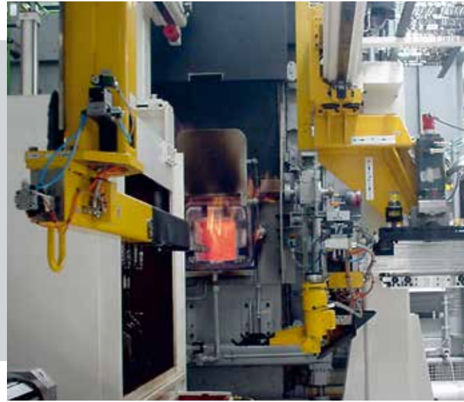
Carburizing and rotary hardening of shafts.

Moreover, continuous development and the background of a large manufacturer give you further safety.