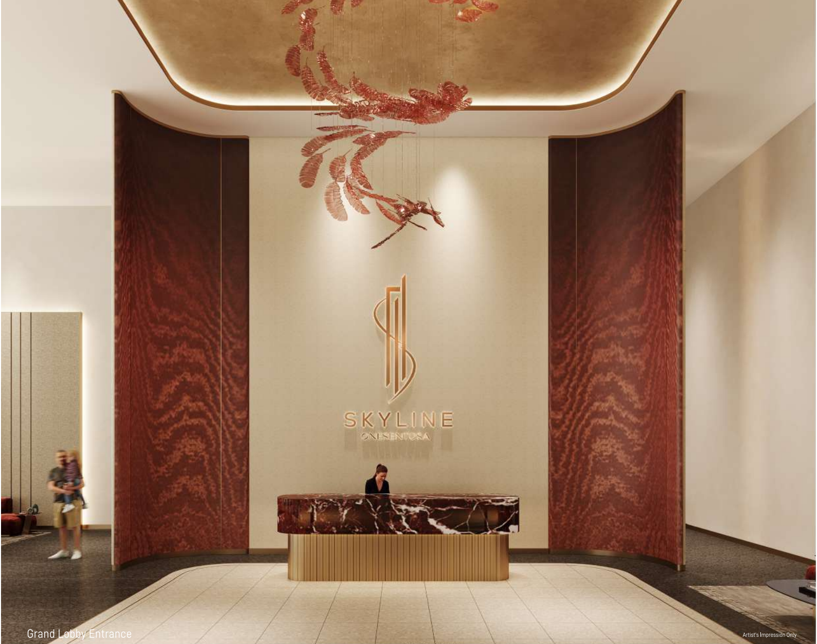
Grand Lobby Entrance