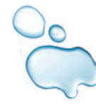
face mist & moisturizer