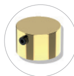
base actuator PP | PP + ALU