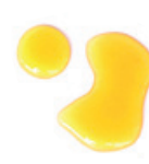
face & body oil