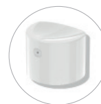
spray actuator PP