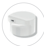
cream actuator PP