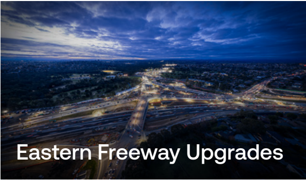
Eastern Freeway Upgrades