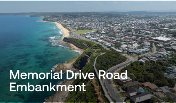
Memorial Drive Road Embankment