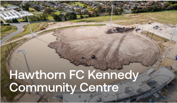
Hawthorn FC Kennedy Community Centre