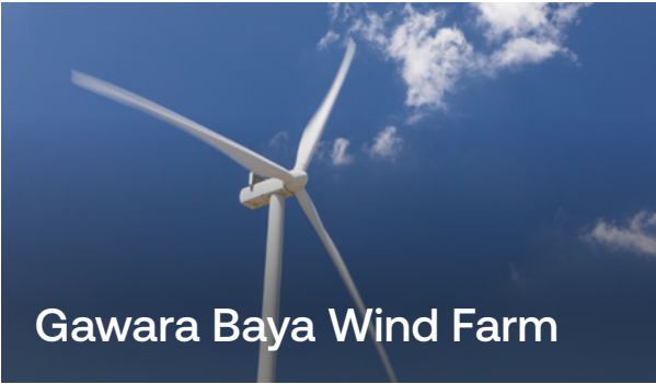
Gawara Baya Wind Farm