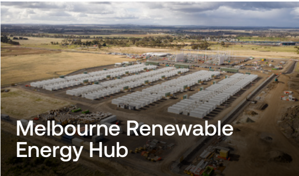
Melbourne Renewable Energy Hub

Picture your fingerprints all over the projects you'll help bring to life.