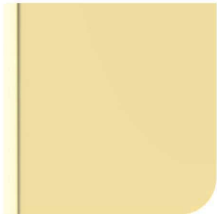
Polished Gold PVD Stainless