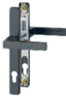
F9714M matt black