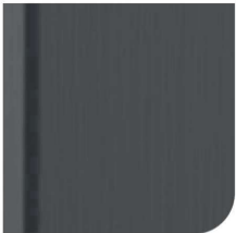
Luna Grey PVD Stainless