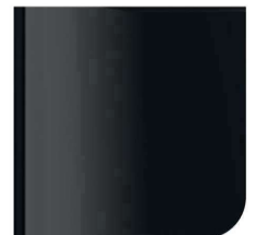
Powder Coated Black Stainless*