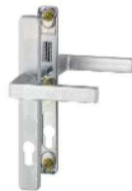
F31-1 aluminium matt stainless steel effect