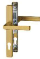
F4 aluminium bronze effect