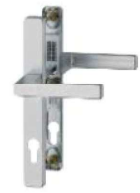
F9 aluminium steel effect