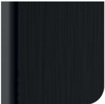
Luna Black PVD Stainless