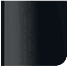
Powder Coated Black Stainless*