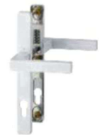
F9016 traffic white (diamond white)