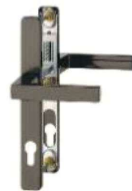
F8707 dark brown