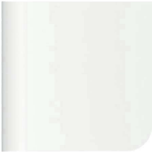
Powder Coated White Stainless