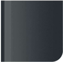
Powder Coated Anthracite Stainless