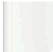
Powder Coated White Stainless