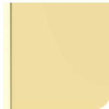
Polished Gold PVD Stainless