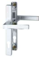
F1 aluminium silver effect