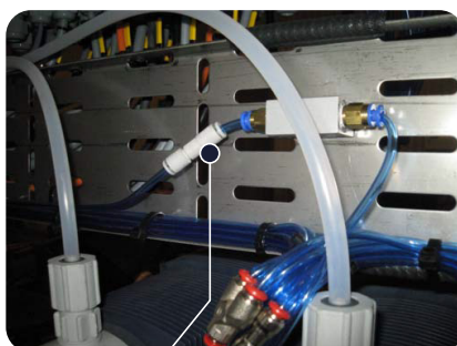
Picture 2. Non-return valve 4 mm Article no. 47206