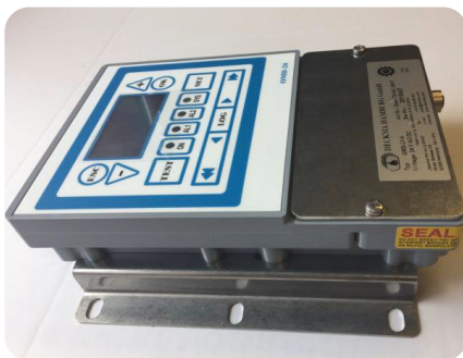
Picture 1. Oil content monitor - computer unit

One seal sticker and two sealed screws on top of the valve, see picture no. 3. Do not remove the seals. You are not allowed to open up the valve for cleaning purposes, you are only allowed to replace the valve with a new one. The two sealed screws should never be opened. Some valves distributed are missing the sticker (PN 00212381/00314402) on the bottom of the valve but the screws are sealed with the red paint.