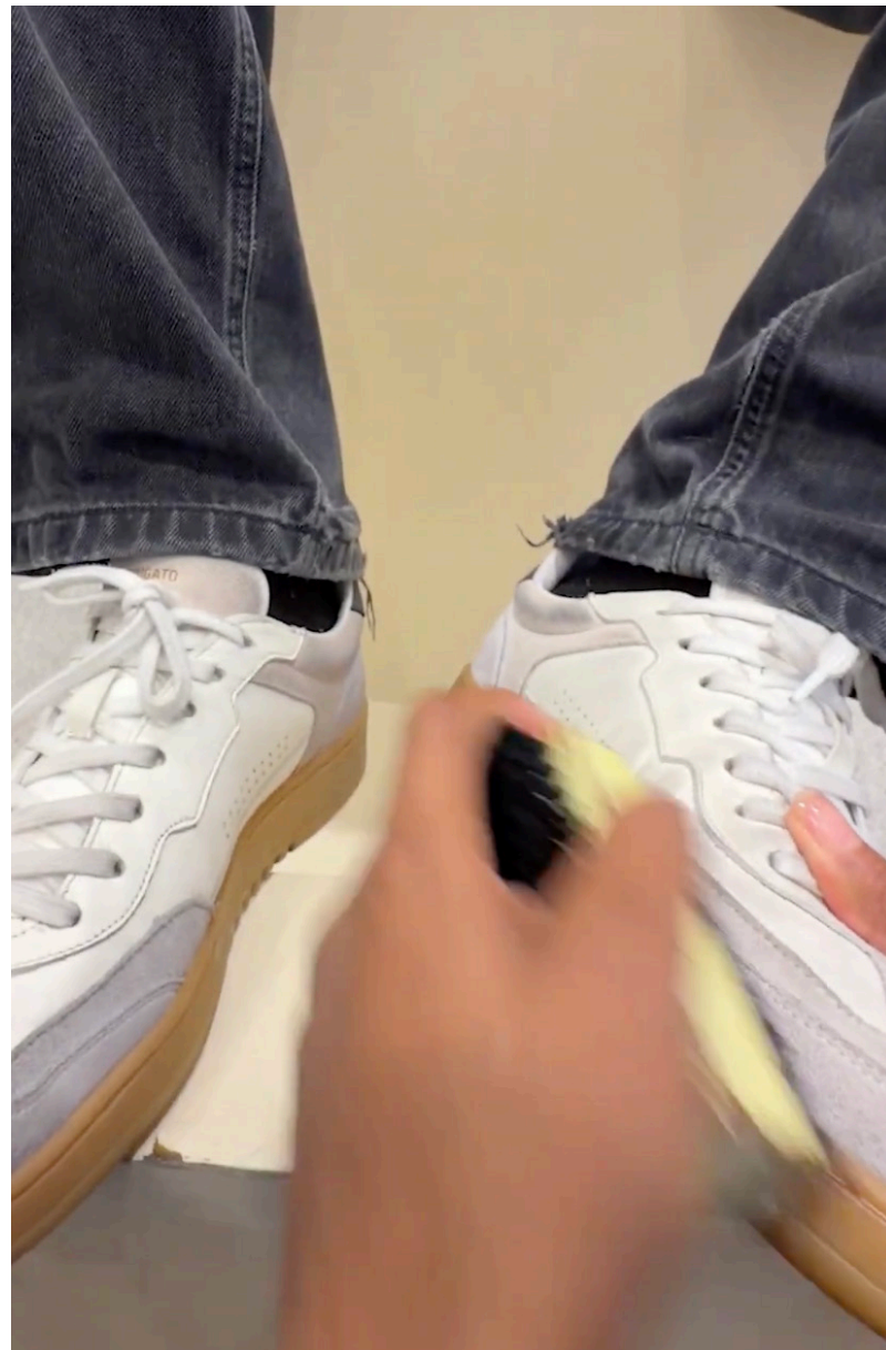
Sneaker Cleaning Church