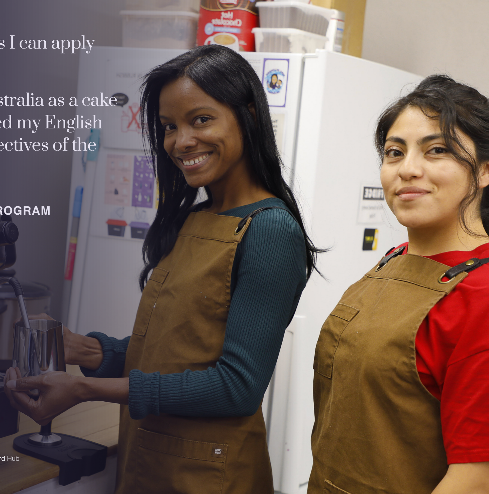
Image: Hospitality Sisters learning barista skills at Abbotsford Hub

‘I got my first job in Australia as a cake decorator. I’ve improved my English and gained new perspectives of the Australian life.’