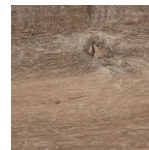
Reclaimed Oak AROW7870