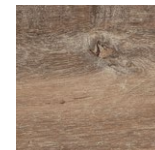
Reclaimed Oak AROW7870