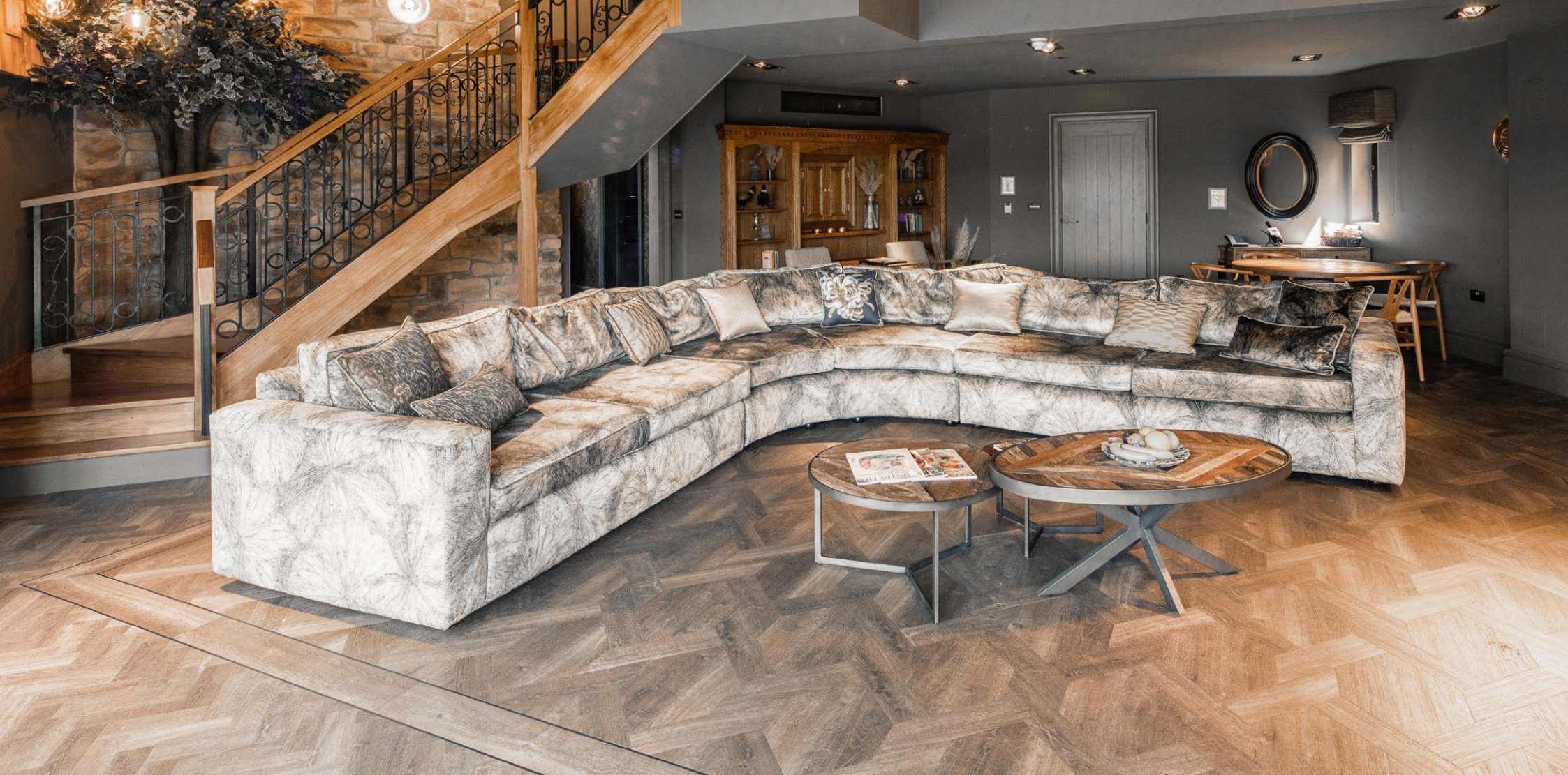
↗ Featured Reclaimed Oak