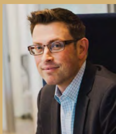
New hire in 2022