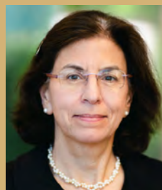
New hire in 2022