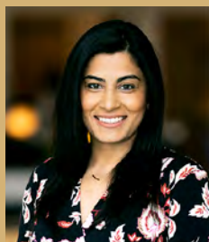
New hire in 2022