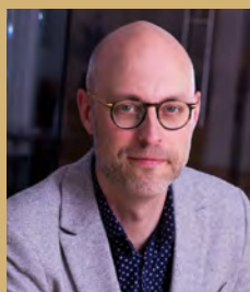
New hire in 2022