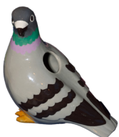
Porcelain pigeon Manta Design • Level D: S Dakar 116