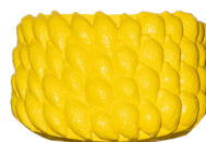
Lemon vase Decostar • Level D: E Dijon 331-334