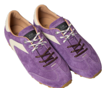
Twins sneakers Distribution • Level F: Frankfurt 032