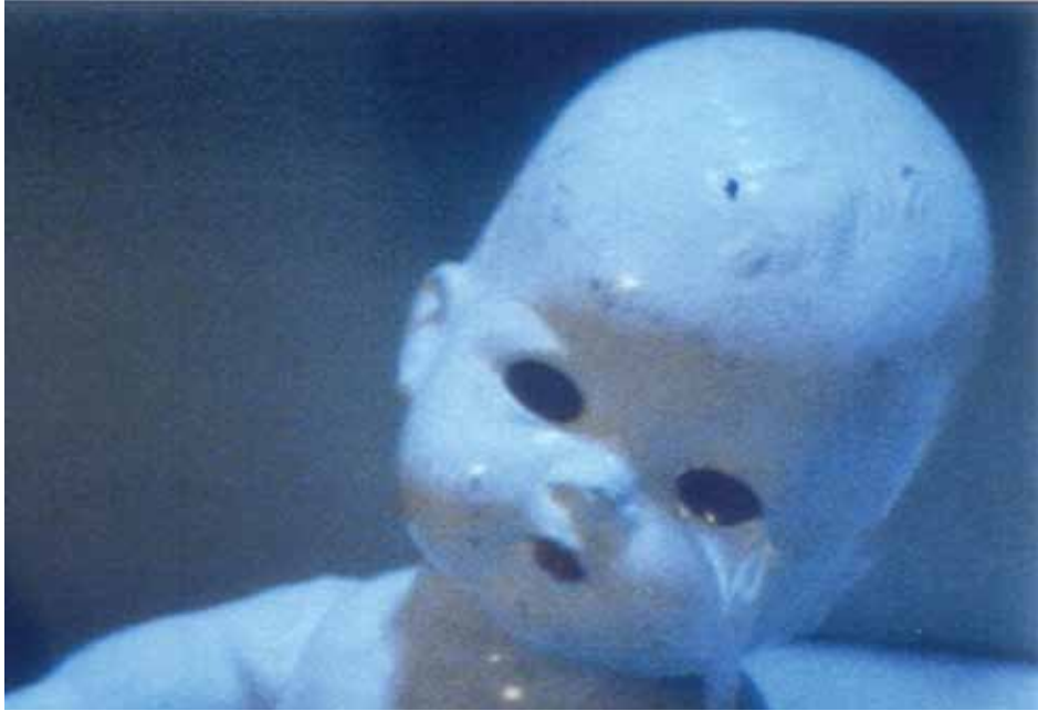
Still from Beauty Becomes The Beast , 1979