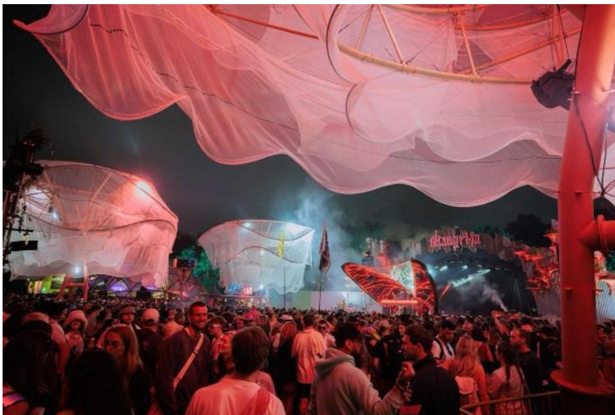
PoliNations Trees by Trigger, at Shangri-La Glastonbury Festival 2025, captured by Giulia Spadafora

Trigger dream-up, create and produce bold and brave live events. We interrupt daily life, reimagine and revive public spaces and put audiences and togetherness at the heart of everything we do. Our work is accessible, inclusive and boundary pushing. It's always memorable, often large-scale and outdoors. We create epic imaginative spaces, fly giant dragons and grow magical pop-up gardens. We showcase new, emerging, inspiring talent.