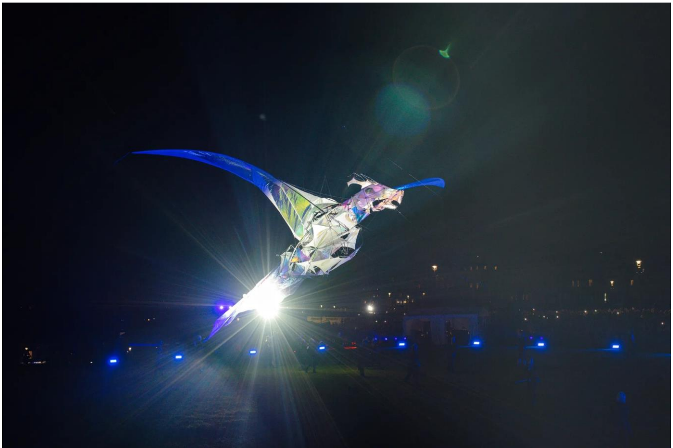
The Hatchling in Plymouth, 2021. Created and produced by Trigger.

Trigger create and produce surprising live and digital events that interrupt daily life, reimagine and revive public spaces, and put audiences at the centre of the action. Trigger's programme aims to create accessible, inclusive and boundary pushing work which is often sited outdoors and/or digital. Our work is brought to life by a team of cross-disciplinary artists and creatives, often showcasing the creativity of local communities.