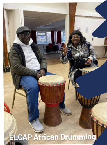
ELCAP African Drumming