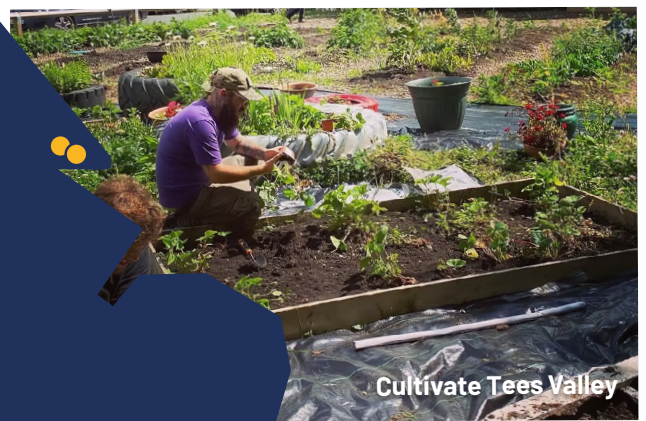
Cultivate Tees Valley