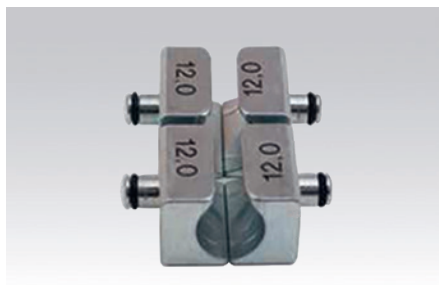
FOR ROUND BELTS